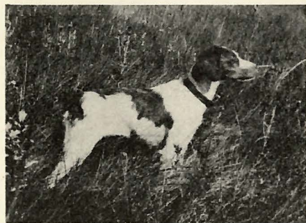
Ch. (B) Angeliqne de Bretagne