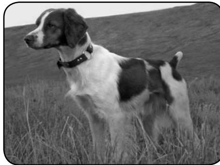
CH ROCKLAN'S SMART ALEC KID