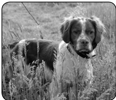
SIR ROSCIUS RALPH OF GASCONY MH