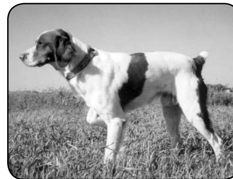
FC/AFC TRADEMARK ICEMAN