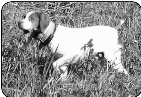
FC SNIKSOH SALLY