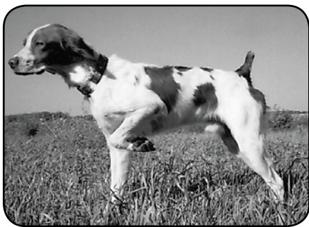
FC/AFC UPLAND ACRES OVERLAND EXPRESS