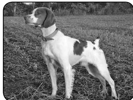
DC/AFC STARLIGHT'S BLAZING SIRUS