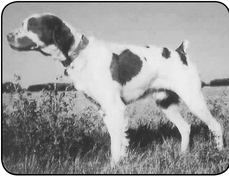
FC/AFC BRISCO'S MR. STUB