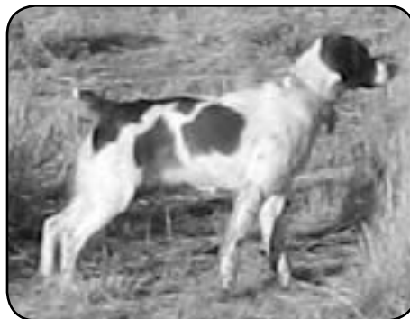
CH MIDAS BLAZIN' AMBER SKIES