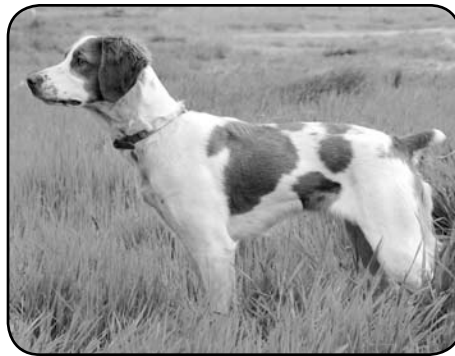
DC BRETON'S TRUCKEE RIVER GOLD