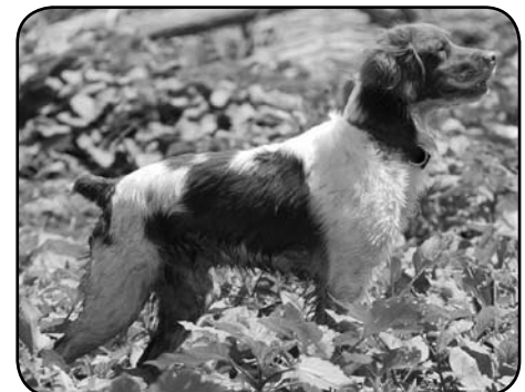
BRIGADE'S OSCAR DE LA BRITT SH