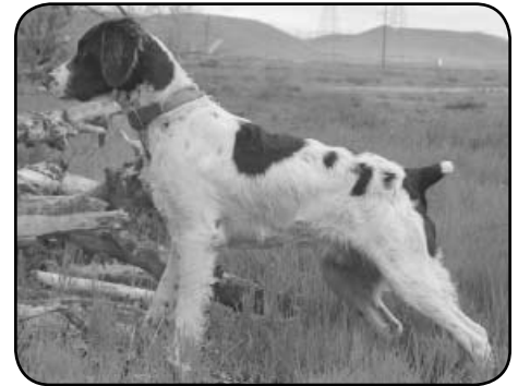
BRETON'S GOLD RUN RUFFIAN