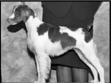
GCH Willowick Talltean