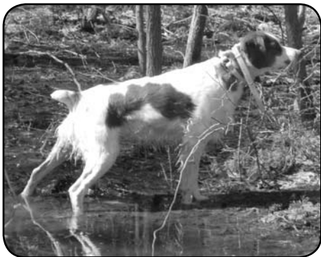
BRITWOODS DOUBLE JEOPARDY