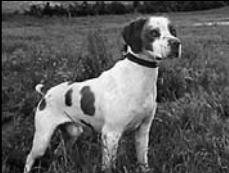
FC/AFC Celebrations Two Of Hearts