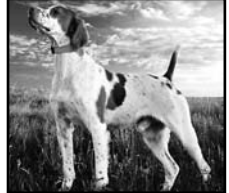
NAFC/FC/AFC Maxwell's Blew By You II