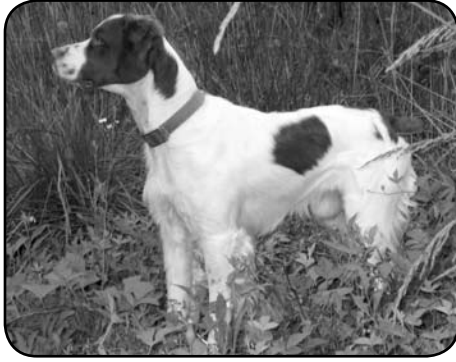
CH SIGBRITS CATCH ME NOW