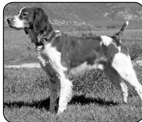
FC MB'S MAKE MINE A DOUBLE