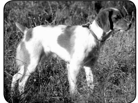
SHILOH'S SWIFT KISS A TAQ