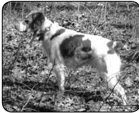
CH BRITWOODS SMOKING GUN