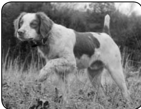
FC/AFC MAXWELL'S GUNSMOKE