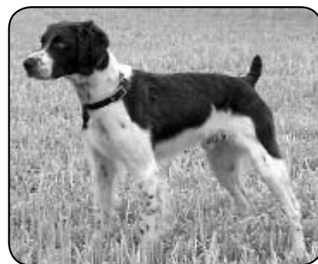
DC/AFC MEGASMOKE GRAND FINALE