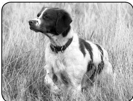
CH BRIGADE'S HI HOPES ROCKET JH