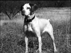
FC/AFC Jazz's Sweetest Little Secret