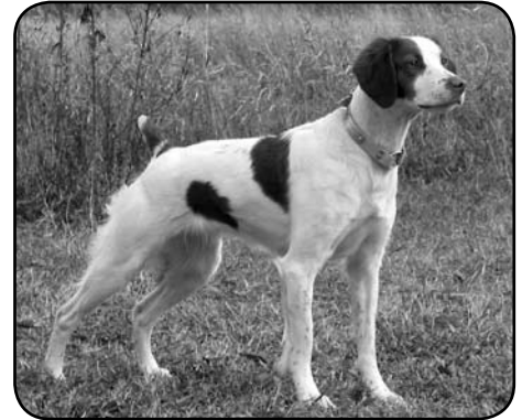
J&M JAX SUGAR BABE