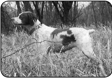
FC/AFC HY STEPPIN MAGGIE