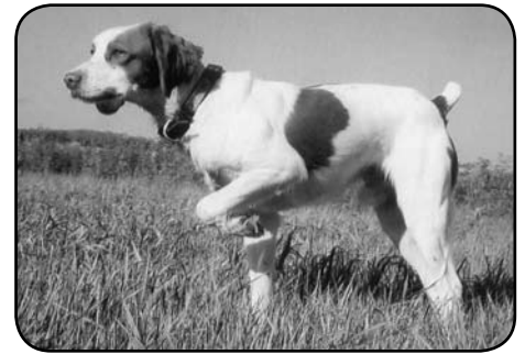
FC TRADEMARK'S ATM