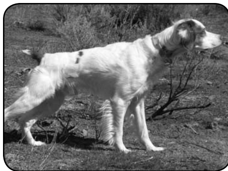
FC/AFC CACTUS MAXIMUS