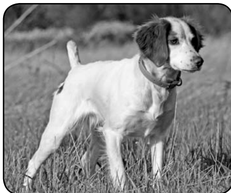
REDROCK'S SIESMIC SNIKSOH