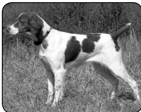
FC BUCKAROO'S CANDY DEE-LITE