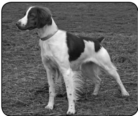
AMMO'S SOME LIKE IT HOT