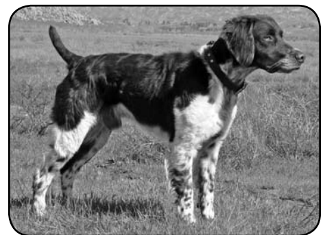
SMOKIN GRAND FINALE