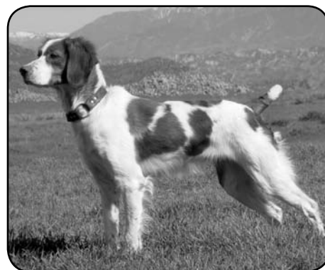
FC MB'S RUBY RED TEQUILA