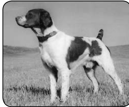
CH SANBAR CROSS CREEK REPETE CALL