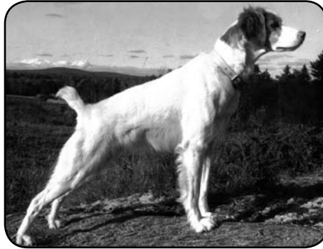
FC/AFC HYBRITTIN'S BJ BETTY