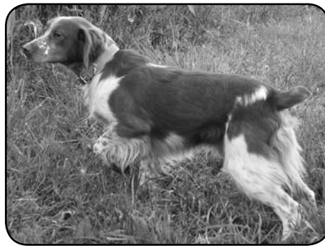
FC/AFC COVEYRISE THIS BUDZ 4U