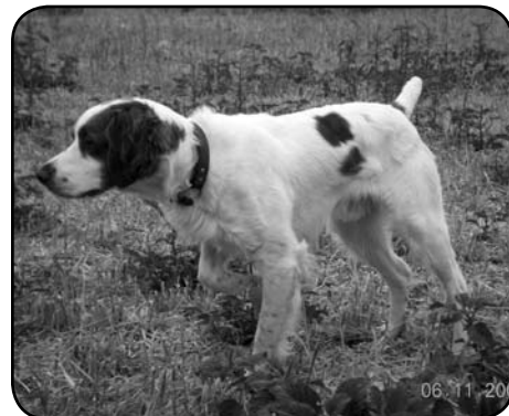
FC FOSTER'S BUDDY II