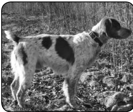
FC/AFC LITTLE ROCK IT MAN