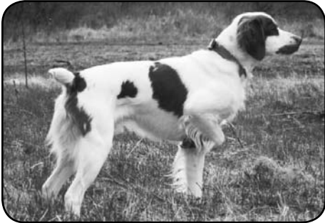
DC/AFC SWEETWATER BILLY TUCKER