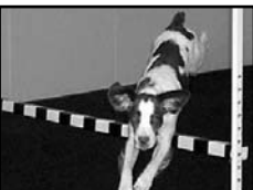
Jayhawker's Lucky Jack UD