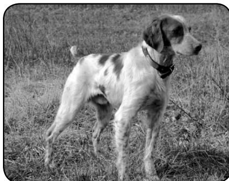
DIAMOND HILL DEUCES GONE WILD