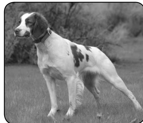
CH ALMADEN'S LONE SHADOW DANCER