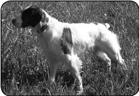
DC/AFC WRIGLEY'S CHIP MAKIN' HIS MARC