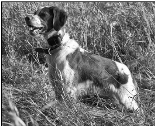
RJA CAPTAIN'S HEART-O-GOLD SH 'Bailey'