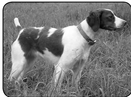
FC JAY HAWK'S GEORGIA GIRL