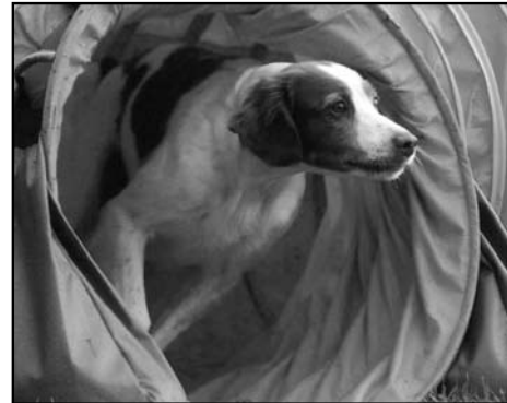
CH MACH KEILI'S BLAZING STAR CDX RA JH NF 'Maille'