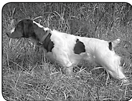
ANJ'S AMAZING GRACE