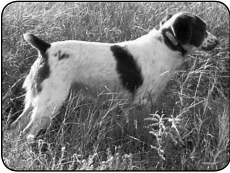
DC WAYSIDE'S BLUERIDGE RUNNER