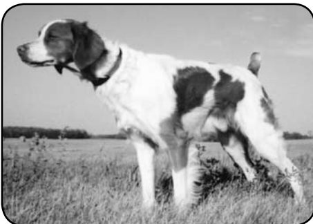
FC/AFC GRAND JUNCTION JAKE