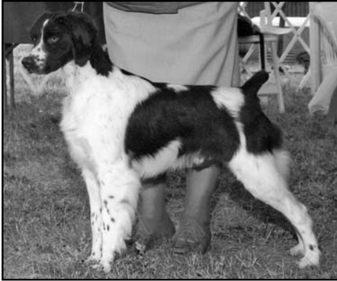
Juvenile Field Trial Dog CH Country Road's Night Rider "Levi"