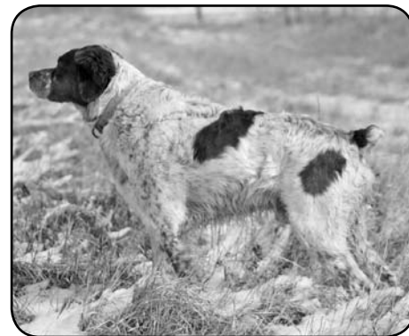
FC R&J'S BUZZ CUT