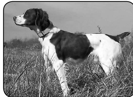
FC/AFC SHALE VALLEY'S MYLA TECH