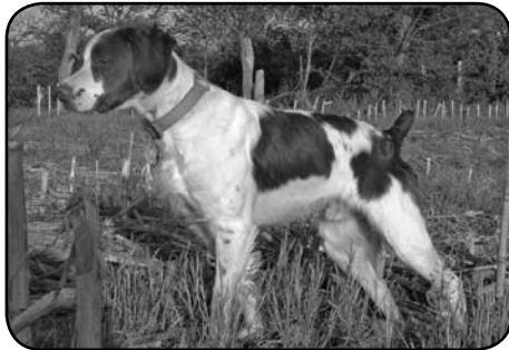
DC RICO'S HI PROOF BOOTLEGGER