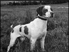
FC/AFC Celebrations Two Of Hearts