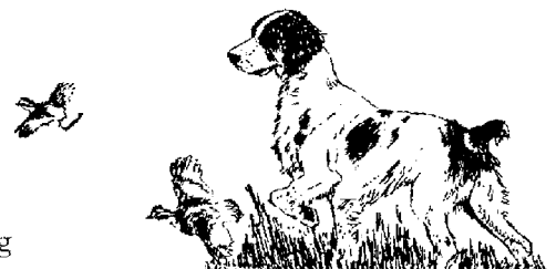
Brittany A "Dual" Dog