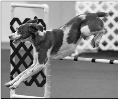
Agility Dog Cupid's Beau and Eros, CD, AX, MXJ, XF "Beau"