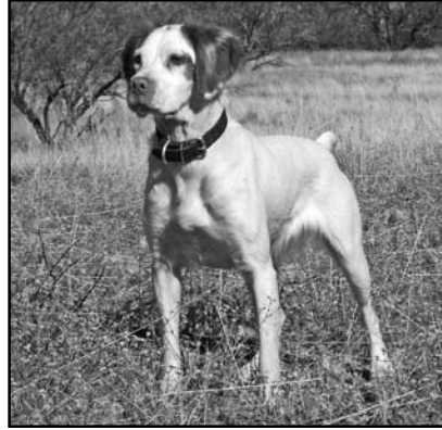
Adult Field Trial Dog 2xAmFld Ch/NAGDC/FC/AFC Jazz's Sweetest Little Secret "Karo"