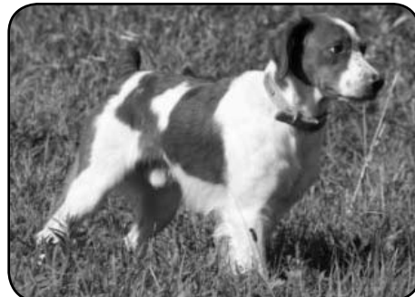
AFC SPRING HILL'S HEMI MAGNUM