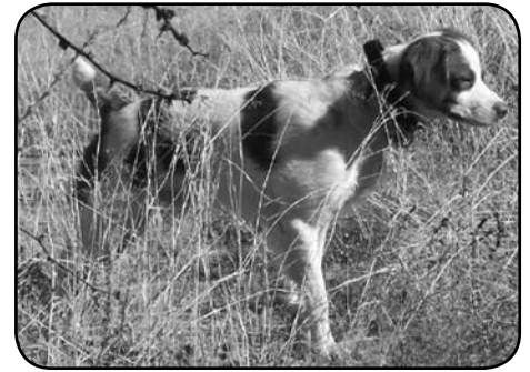
AUTEN'S RANGER RUDY RjLJ

On page 37 of the February 2011 issue, the following photo should have been published with the Michigan Saginaw Valley Amateur All Age results.