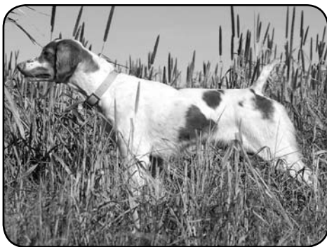
MAXWELL'S SOUTHERN HOSPITALITY