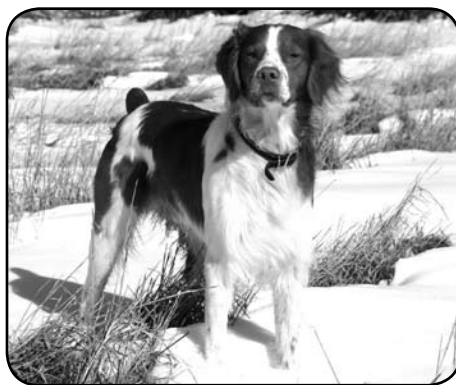
RENCROFTS DETROIT RASCAL