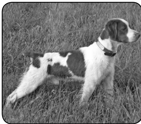
DC/AFC BISCUITS ECKO OF DREAMS