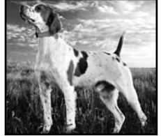
NAFC/FC/AFC Maxwell's Blew By You II