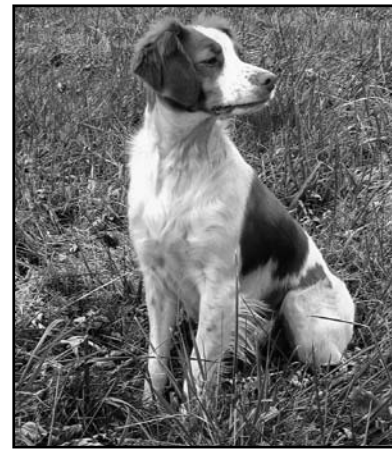
CH BROOKWOOD'S MARDI GRAS JH CD MX MXJ NF 'Millie'