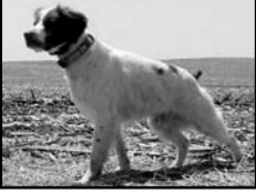
DC/AFC Ru-Jem's A Touch Of Bourbon