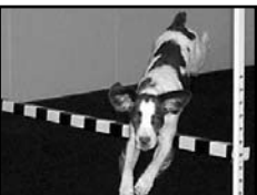
Jayhawker's Lucky Jack UD