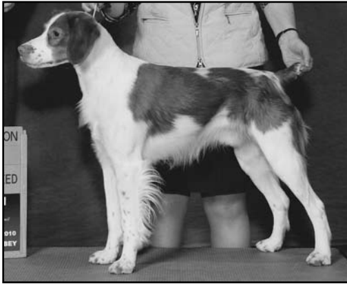
CH RJA T-STORM'S FIRE N SMOKE 'Red'