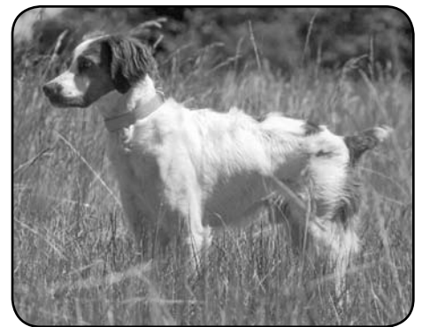
DIAMOND HILL DANCER