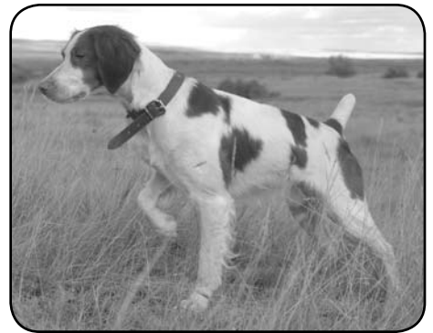
FC KD'S SLIP AND SLIDE

We want to thank all the workers that helped make this a smooth running event. We applaud them for their time and efforts.