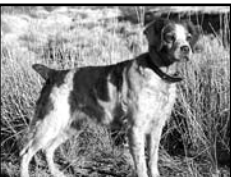
DC/AFC TJ's Single Shot of Scipio