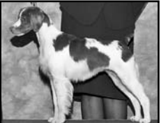
GCH Willowick Talltean