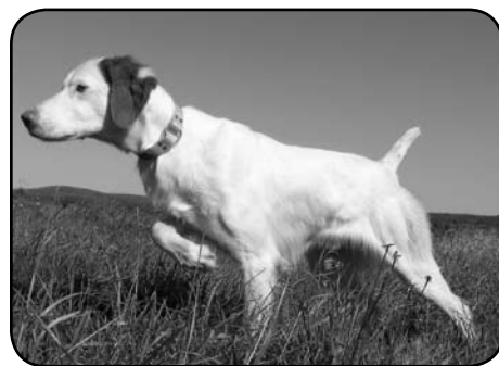
FC PINEY RUN ART