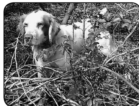
FC BROADWAY JOE VI