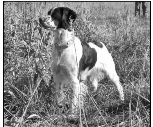
Hunt Test Dog CH VEM Call Me Sassie Sue, MH "Sassie"

2010 Charley Felgenhayer Memorial Trophy Amateur All Age Winner - LaSalle Brittany Club