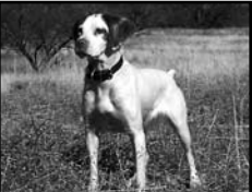
FC/AFC Jazz's Sweetest Little Secret