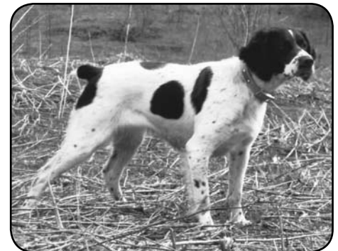
FC CHOC TALK'S DIAMOND