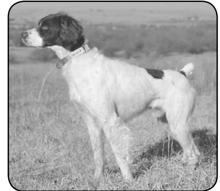
FC WIMBERLY JIMDANDY