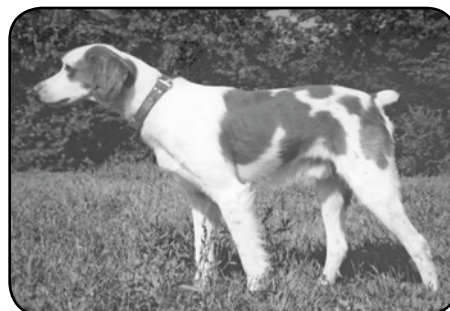
FC/AFC SHAMROCK'S SIRIUS