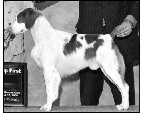
Show Dog CH VEM Country Mile "MJ"