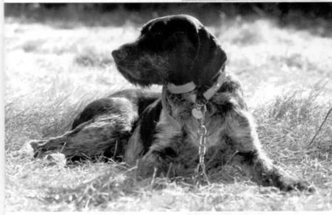
... an adult dog that knows the drill, has formed a very positive behavior pattern, and is all business when it's time to work.