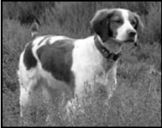
DC/AFC MTB Cabo Rita De Scipio