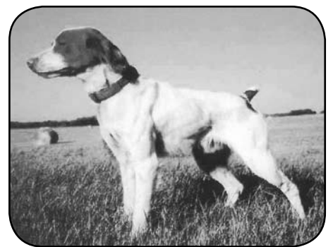
FC/AFC TRUCKER'S WILD RIDE