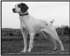
FC Savannah's Hot Shot