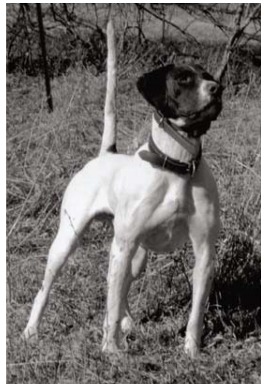
When finished, the dog should have confidence, style, and class.

At a young age, this is easy to accomplish by developing a behavior pattern. We pick up the puppy and hold it in our arms, only putting it down when it is calm and relaxed. Struggling will not let it escape, and it soon learns that being relaxed is the fastest way to get attention from us as well as to be released. Imagine how nice that would be on the breakaway when you're releasing your dog to hunt: All the attention and focus would be on waiting like a coiled spring for the cue from you to go hunt, and there wouldn't be that wild wrestling match we see far too often. Being calm doesn't mean being less energetic; being calm means focusing on the job