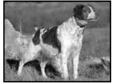
DC/AFC MTB Cabo Rita De Scipio