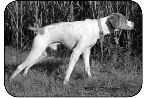
FC/AFC HOPES CAROLINA SUNSHINE