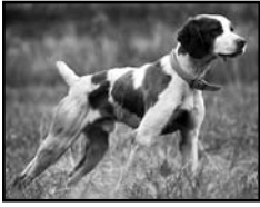
NGDC/FC/AFC Hits All Jack'D Up