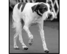
OTCH Lane's End Fortune UDX 9, OGM, AX, AXJ