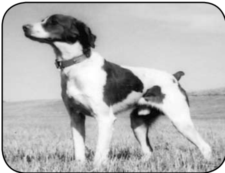
BLACK CREEK TIM