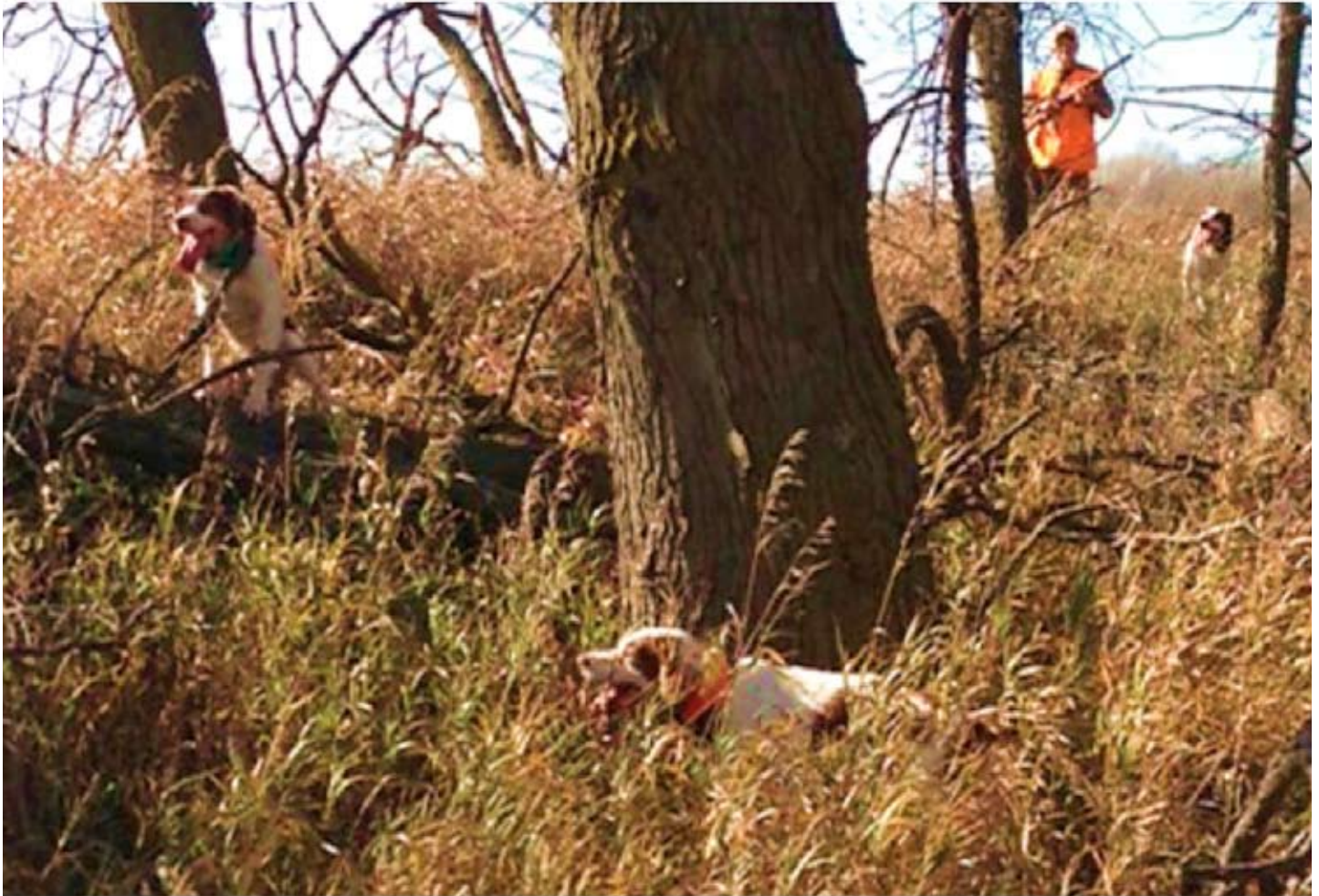
Three generations, Scout center, Tracker left, and Cowboy right on their last hunt together Nov 10 2012

My love for Brittneys began when I was a little boy with a Brittany given to my dad by a family friend. Many years later, after returning from pheasant hunting with my dad and friends I decided I was going to finally get my own dog. I knew nothing about bloodlines or what to look for, I just opened the classifieds and found an ad for Brittany puppies, $250.00.