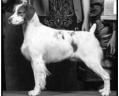
CH RAINBOW SPLASH'S RUGGEDLY HANDSOME