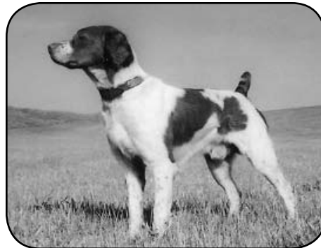
DC SANBAR CROSSCREEK REPETE CALL