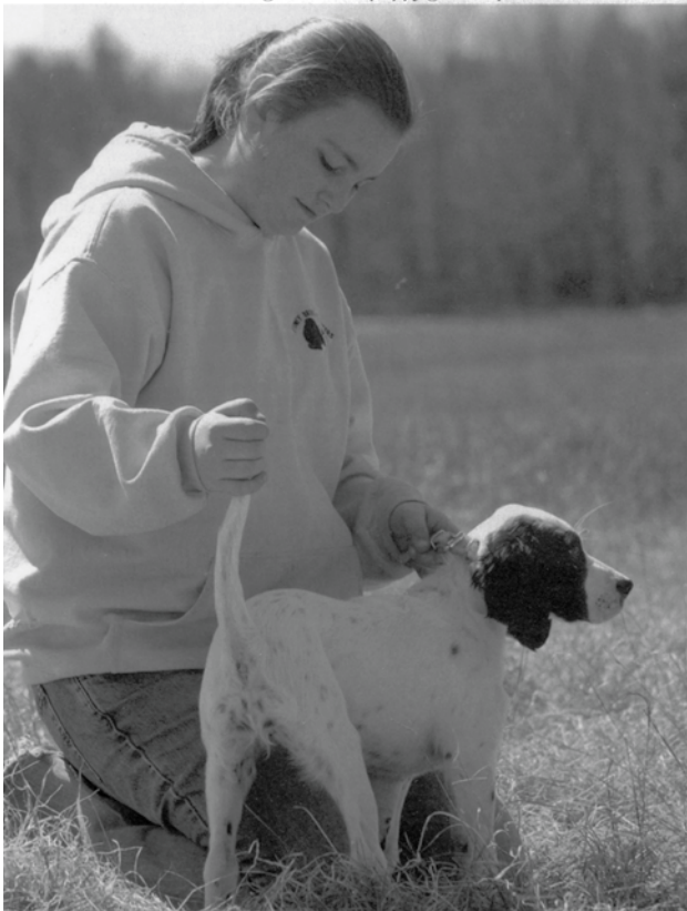
Time spent teaching a puppy to stand still forms a positive behavior pattern that leads to easier training when that puppy grows up.

Another behavior pattern we like to begin early on is the stakeout chain or chain gang. While we may not be heeling