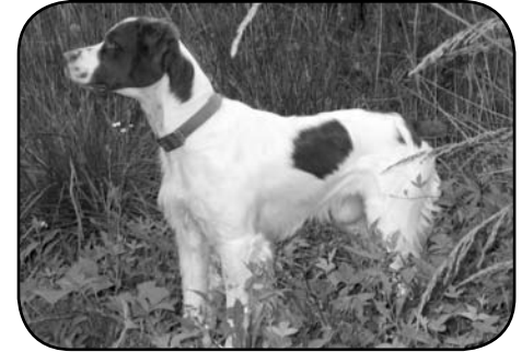
DC SIGBRIT'S CATCH ME NOW JH