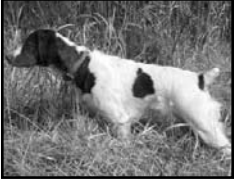
FC/AFC ANJ's Amazing Grace