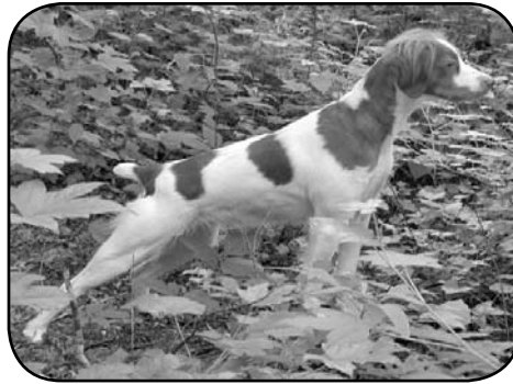
PBF AMMO'S HELLO DOLLY