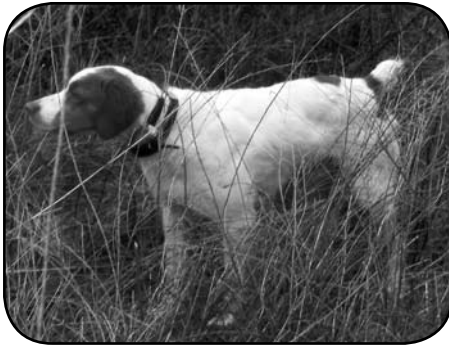
FC WOLF RIVER'S WINNING TICKET