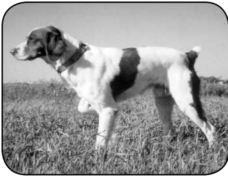
FC/AFC TRADEMARK'S ICEMAN