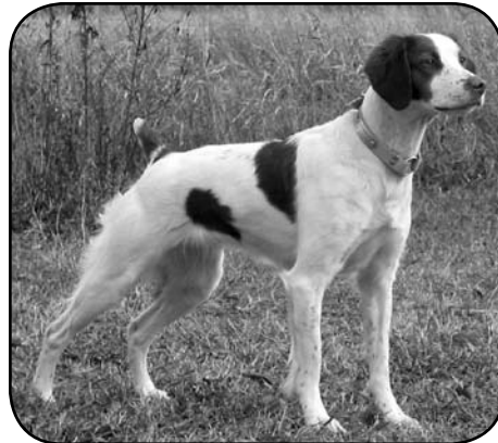
FC/AFC J&M JAX SUGAR BABE