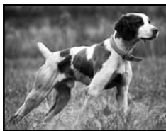
NGDC/FC/AFC Hits All Jack'D Up