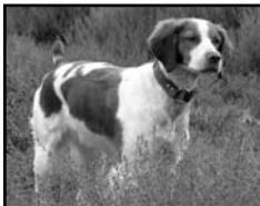
DC/AFC MTB Cabo Rita De Scipio