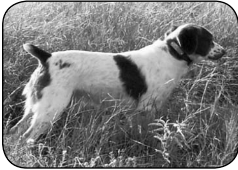
DC WAYSIDE'S BLUERIDGE RUNNER