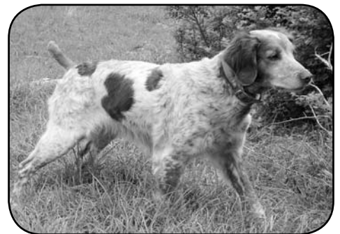
FC AMERICAN IDOL