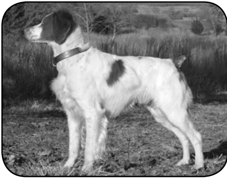
SHADOWS IN A TWIST