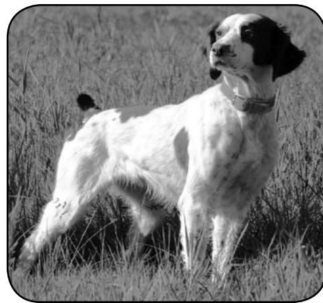
FC/AFC JOKER'S JACKPOT