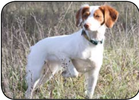
JJ'S ALABASTER ANGEL