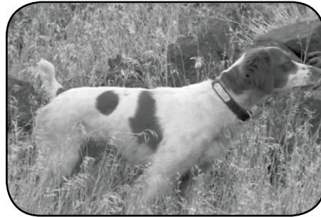
NAFC/FC/AFC SPANISH CORRAL'S SUNDANCE KID