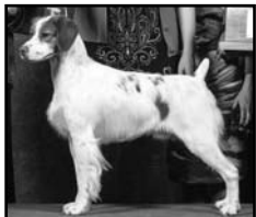
CH RAINBOW SPLASH'S RUGGEDLY HANDSOME