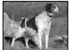
DC/AFC MTB Cabo Rita De Scipio