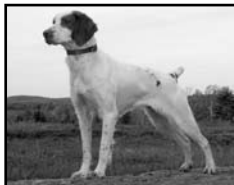
FC Savannah's Hot Shot