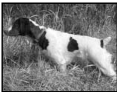
FC/AFC ANJ's Amazing Grace