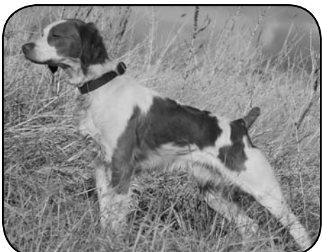
GCH DC MASKED JACK OF DIAMONDS