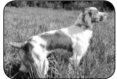
FC SWEETWATER MURPH'S A GAMBLER