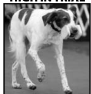
OTCH Lane's End Fortune UDX 9, OGM, AX, AXJ