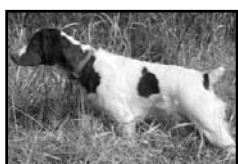
FC/AFc ANJ's Amazing Grace