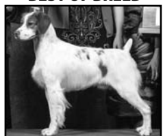
CH RAINBOW SPLASH'S RUGGEDLY HANDSOME