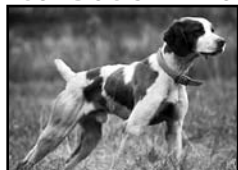
NGDC/FC/AFc Hits All Jack'D Up