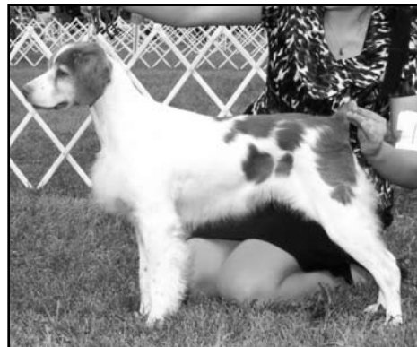
Best of Opposite Sex to Best in Veteran Sweepstakes / Select Bitch CH SOVEREIGN'S CLASSY ATTITUDE JH