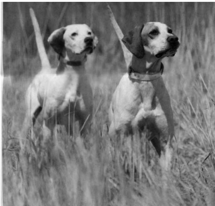
Sporting dogs may encounter situations in the field with the potential to cause serious health problems, so knowing the signs to watch for is key to keeping them in top condition.

Owners of dogs with elbow dysplasia report noticing changes