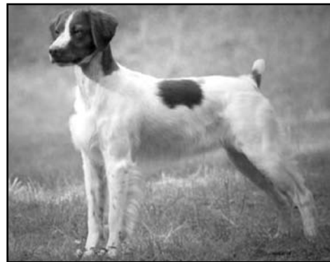
Best of Breed