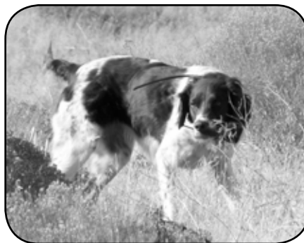
FC D.J.F.'S MICRO BLAZEN BIXEY

Trial; we saw it all: Fog, Wind, Snow, Hail, Sleet, Rain, Sunshine and that was in the first hour. The weather conditions continued all weekend, as they say just wait five minutes in Idaho and the weather will change; and boy did it. The Judges, handlers, dogs and gallery endured rough spring Idaho weather but we completed it in fine form. The weekend trial followed the 2014 Chukar Classic so we had the top dogs of the West running in our trial. Competition was stiff in all of the stakes and a joy to watch if you could overcome the weather conditions. We would like to thank all of our Judges, owners, handlers, club members and non-club members that attended our trial. Thanks to all who helped during the trial, also; from the bird planters to the people that helped cook or clean up yours/b help was noticed and greatly appreciated.