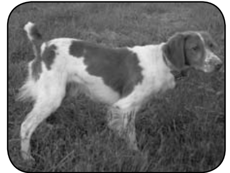
FC/AFC COVEYRISE FLYBOY