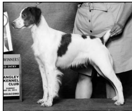
Select Dog CH LABYRINTH N ILLUSION SLIPPERY WHEN WET