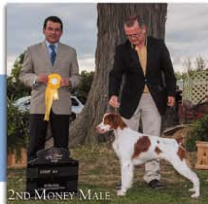
2ND MONEY MALE