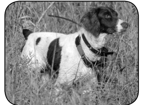
FC TERRA DOT