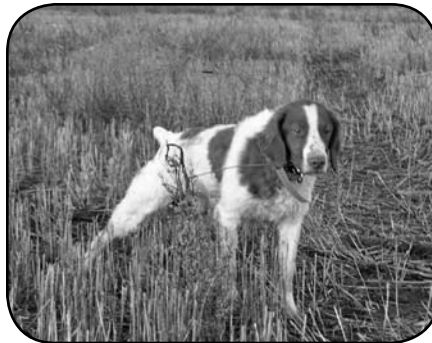
FC/AFC OZ II