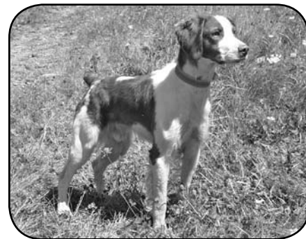
DC/AFC SCIROCCO DEL PRADO