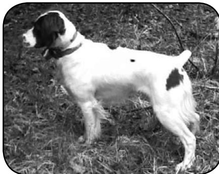
DC/AFC FLASHFIRE'S BANG-A-GONG