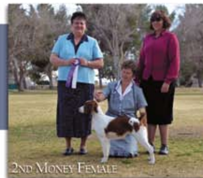
2ND MONEY FEMALE