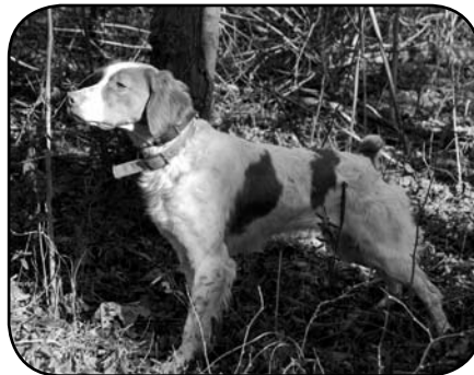
FC COVEYRISE MY GAL SAL