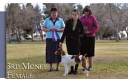
3RD MONEY FEMALE