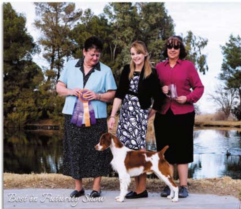
Best in Futurity Show