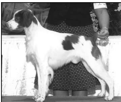
RESERVE WINNERS DOG LABYRINTH NMR CHAMPAGNE DELIGHT