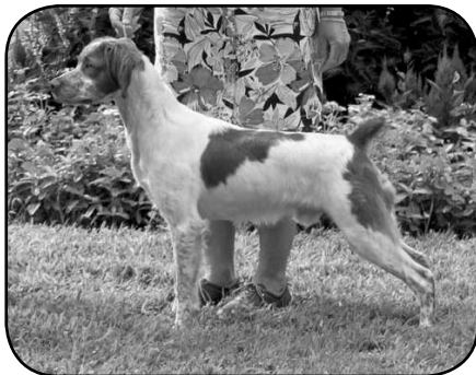
CH DIAMOND HILL DANGEROUS WEAPON