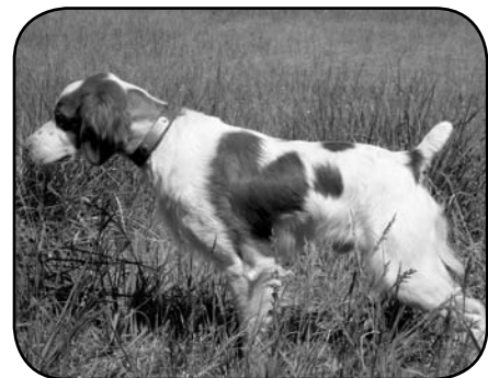
FC MARJO'S JOHNNIE WALKER