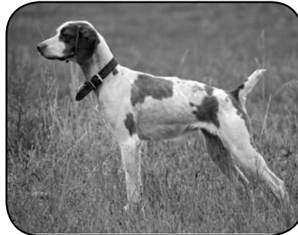
NFC/FC SPARKY'S PRAIRIE WIND GYPSY