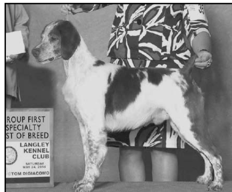
Best of Breed GCH/DC/AFC DIAMOND HILL DANGEROUS MAN

CH LABYRINTH N ILLUSION SLIPPERY WHEN WET