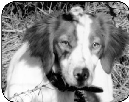
FC MJ'S SWEET SUGAR MAGNOLIA