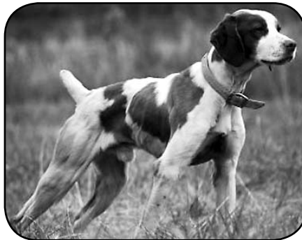
NGDC/FC/AFC HITS ALL JACK'D UP