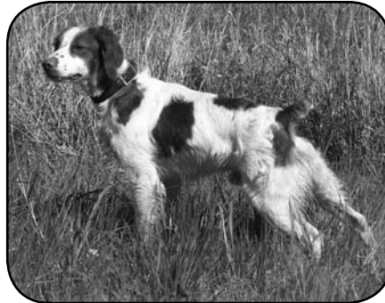
CH BLUERIDGE HUNTER GONNA FLY