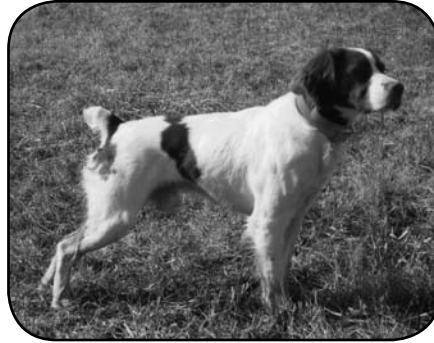
BURNING GLEN ENCORE