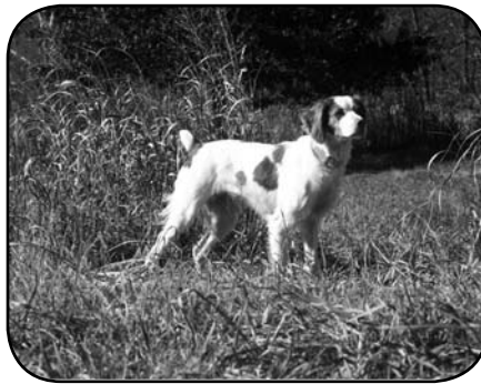
FC WOODLAND'S MONEY PIT