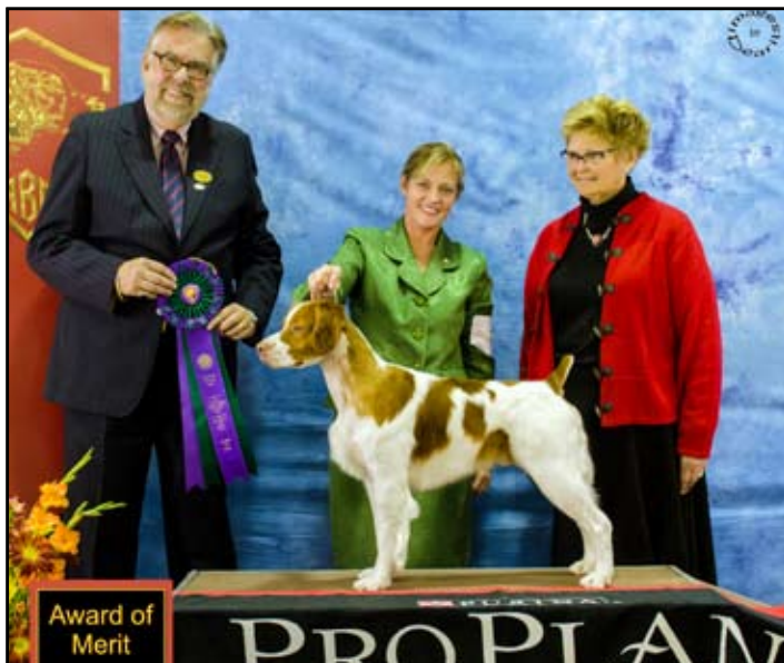
Award of Merit SOVEREIGNS CHASING LEGENDS

Best Bred-by-Exhibitor HOPE'S I CAN'T DRIVE 55