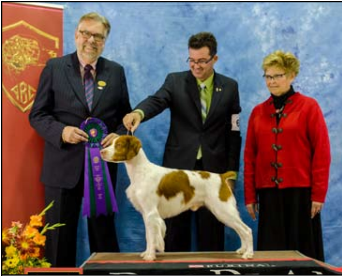
Award of Merit MARSPORT HOT TO RIDE LUCY SEVEN