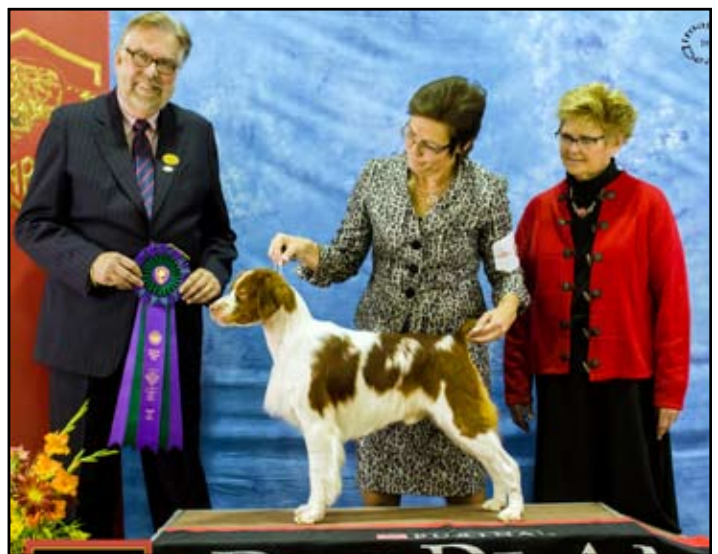
Award of Merit TRIUMPHANTS AS GOOD AS IT GETS