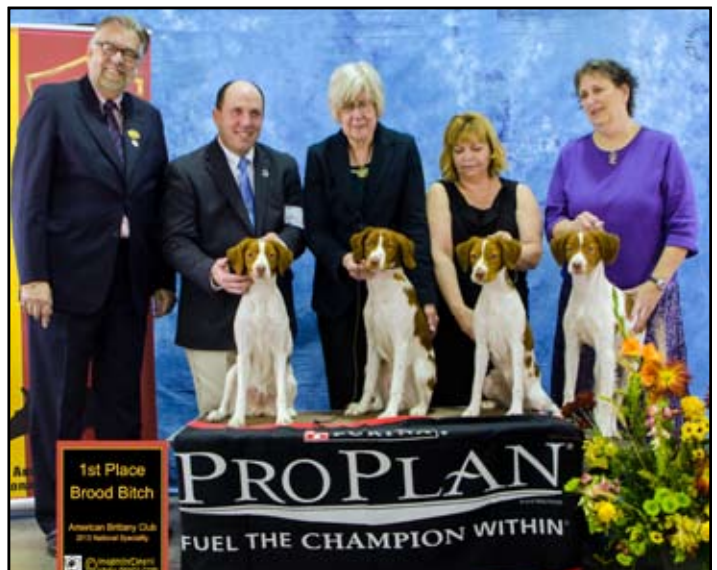
1st Place Brood Bitch MILLETTES SWEET MEMORIES