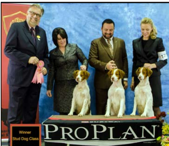
Winner Stud Dog Class TRIOS MR. ROCKTOBER