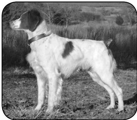
FC SHADOW IN A TWIST