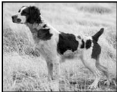
MTB Scipio's Hot Shot of Whizki