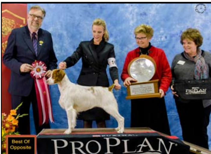
Best Of Opposite Best Of Opposite CH RAINBOWS BIPPITY BOPPITY BOO