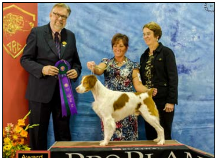
Award of Merit BROOKWOODS JUST TOO HOT