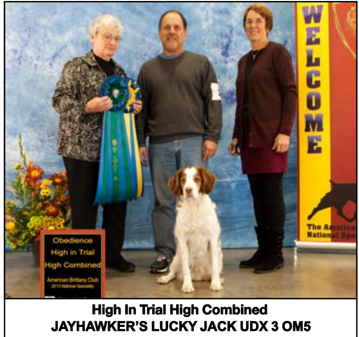
High In Trial High Combined JAYHAWKER'S LUCKY JACK UDX 3 OM5

No Qualifiers Open A, Utility A or Utility B