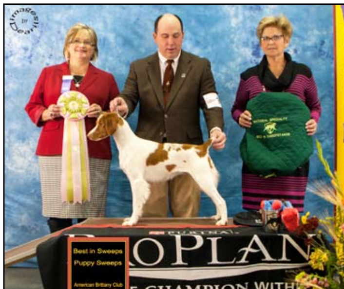
Best in Sweeps Puppy Sweeps, Best Bred-By Exhibitor, Reserve Winners Bitch HOPES I CANT DRIVE 55