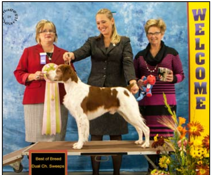
Award of Merit Best Dual Ch Dog Best in Dual Championship Sweepstakes SANBAR CASTLE BUILT ON LEGENDS

Best of Opposite Sex to Best in Dual Championship Sweepstakes DC WILD MTN'S LONE STAR RENDEZVOUS