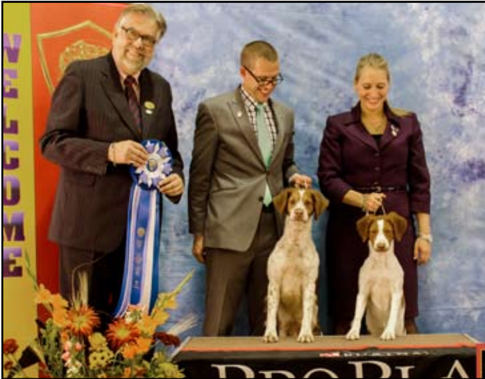
Best Field Dog Best of Winners SANBAR CROSSCREEK REPETE CALL SANBAR CROSSCREEK TELL ME A STORY

Winners Bitch SANBAR CROSSCREEK TELL ME A STORY