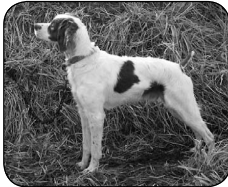
CHIP'S TAILGATE RENDEZVOUS