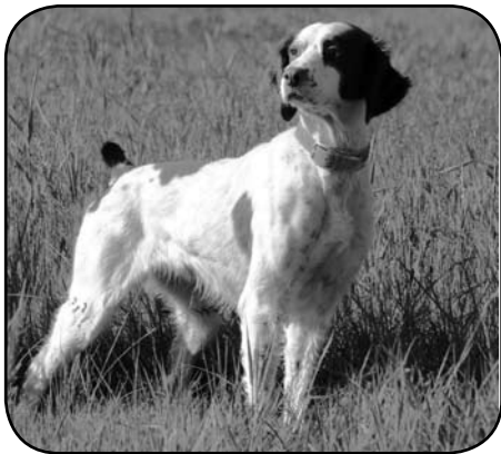
FC/AFC JOKER'S JACKPOT