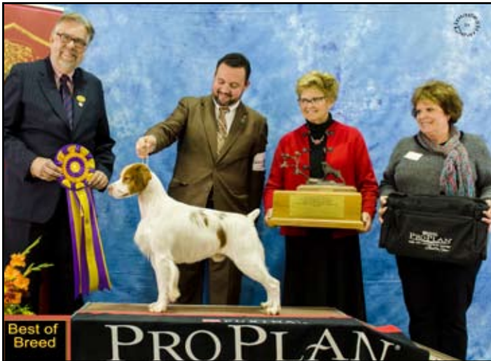
Best of Breed Best of Breed, Winner Top 20 GCH RAINBOW SPLASH'S RUGGEDLY HANDSOME