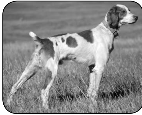
FC HAL-JS SMARTEYES-JOKERS EZ ACE