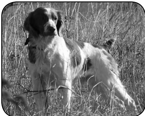
SHADY WAY RED TAIL HAWK