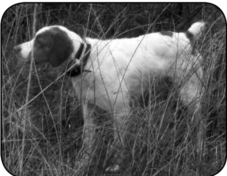
FC WOLF RIVER'S WINNING TICKET