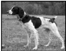
Wimberley Rowdy Bo-Dandy