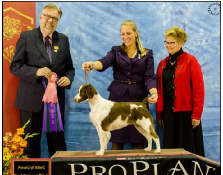
Award of Merit, Best Veteran Bitch SANBARS MUSTAND EVENING ATTIRE