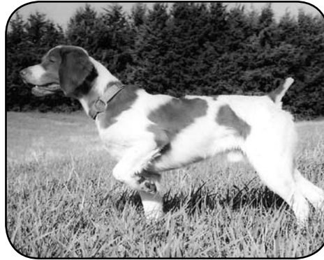
FC ODYSSEY'S ACE OF HEARTS