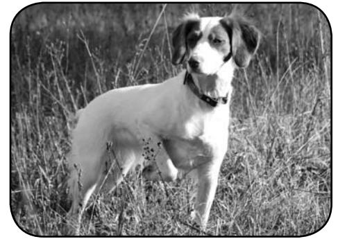
JJ'S ALABASTER ANGEL (ANGIE)