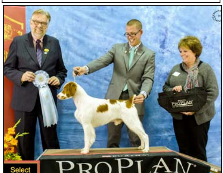
Select Select Dog SANBARS RIDE THE WINDS