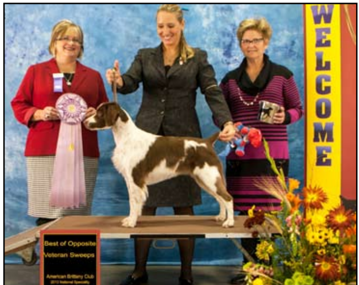
Best of Opposite Sex to Best in Veteran Sweepstakes, Award of Merit, Best Veteran Bitch SANBARS MUSTANG EVENING ATTIRE