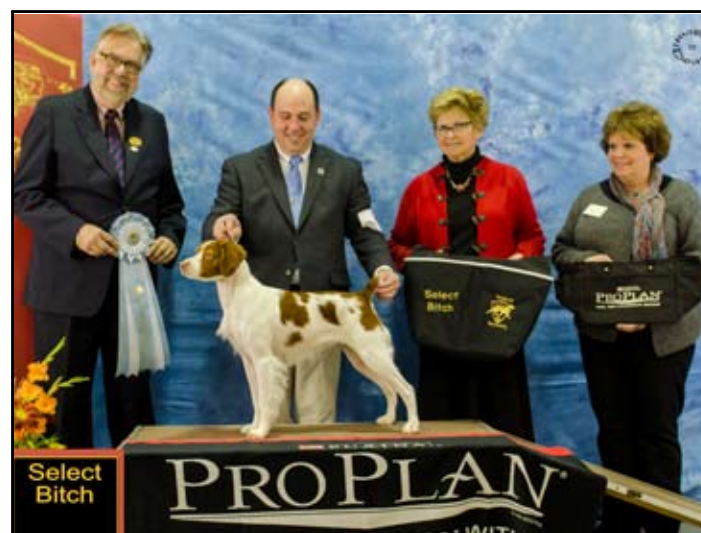
Select Bitch Select Bitch GCH MILLETTE'S SWEET MEMORIES OA OAJ NF NAP NJP