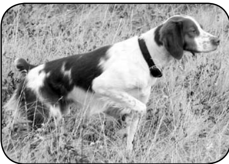
DC KINWASHKLY DIRTY NED PEPPER