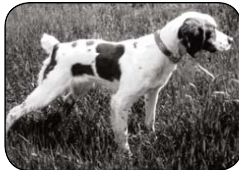
T.J. SCOOBY SIERRA'S ZOEY