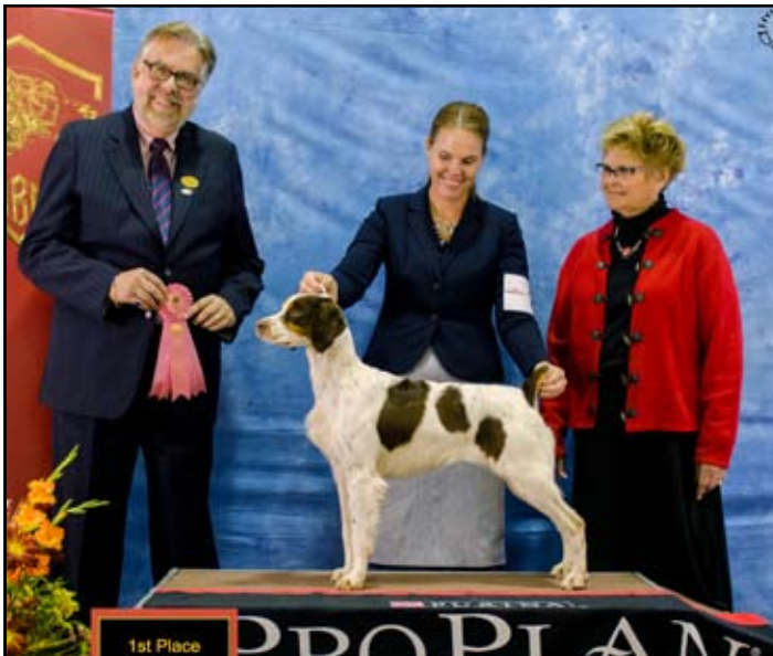
1st Place Field Trial Bitch SHADOWS TEQUILA TRYST