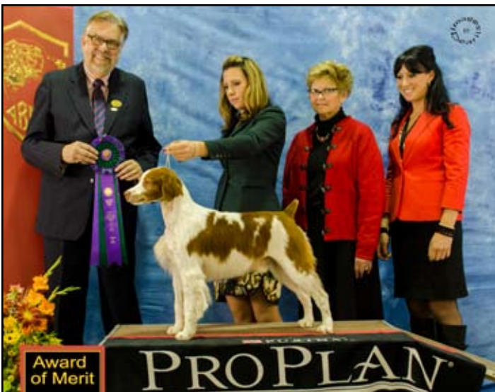
Award of Merit GOURLEYS DFL 99 CARAT DIAMOND