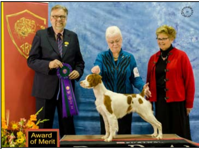
Award of Merit BIG OAKS DELTA SUNKIST BY CREDIT