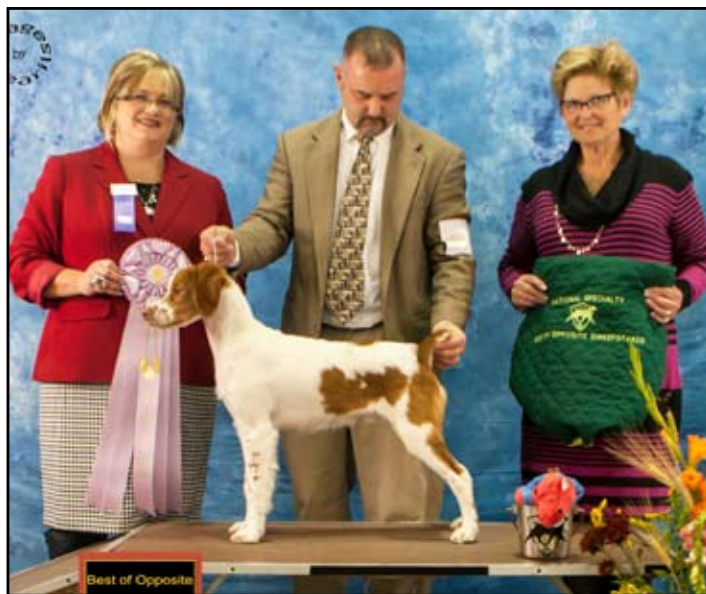
Best of Opposite to Best in Sweepstakes, Puppy Sweeps SOVEREIGNS BEACON OF HOPE