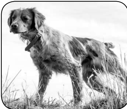
LEAVE-EM IN THE DUST GUS J: