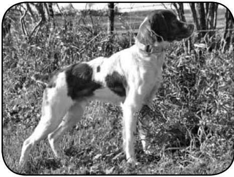
LOST CREEK A SHOT OF BOURBON