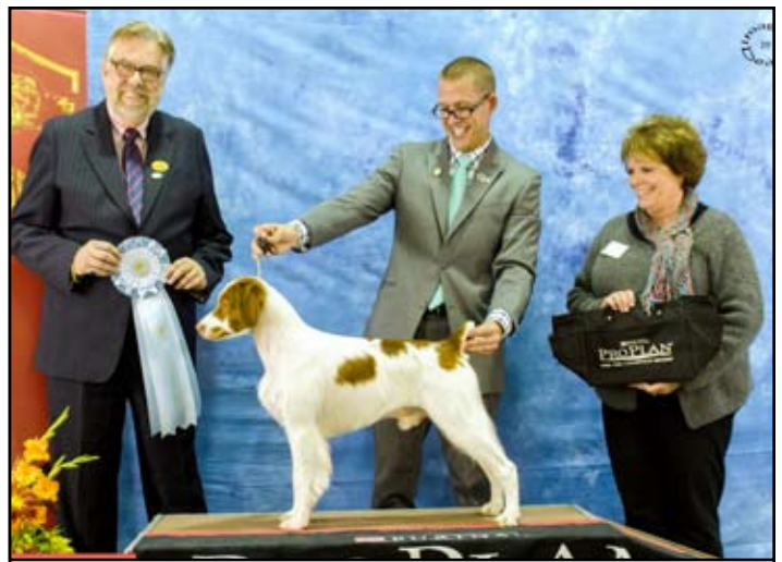
Select Dog GCH SANBARS RIDE THE WINDS