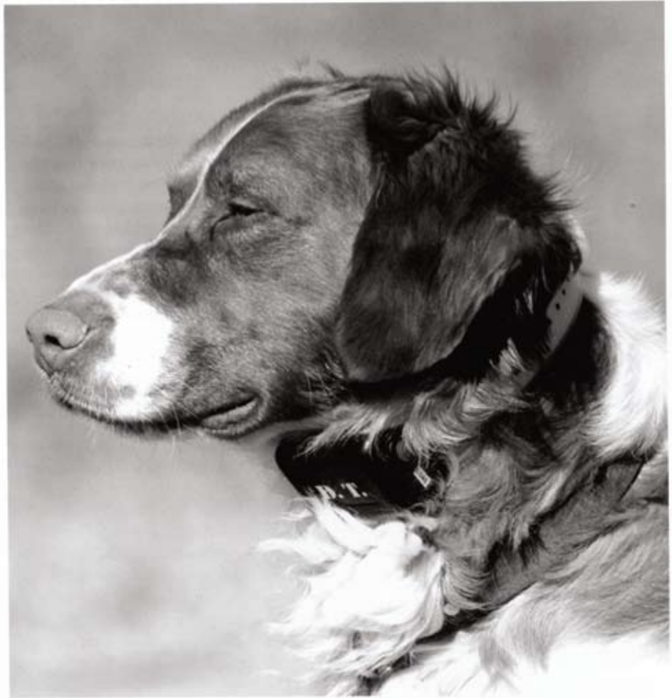
This dog is content to wait his turn on the chain, and wearing the collar is part of the process – one he doesn't mind a bit.

Again, none of these cues work if the dog is not already trained to respond to the stimulation via the checkcord or the whoa-post. If a dog is not responding correctly, it means they don't understand the point of contact. If that lack of proper response is accompanied by vocalization, jumping, running to you, and so on, it means you've either not properly prepared the dog to understand the stimulation or you've used too high a level (perhaps forgotten to turn the level back down to the