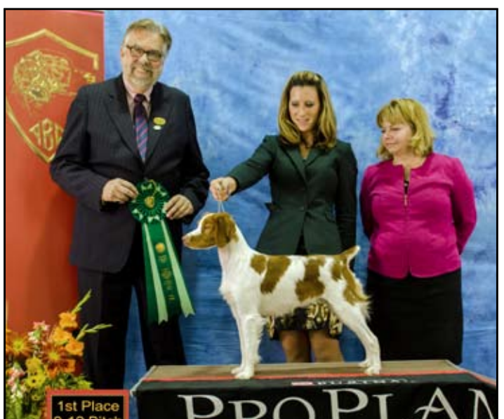
1st Place 9-12 Bitch Best Puppy MILLETTES BENELLI