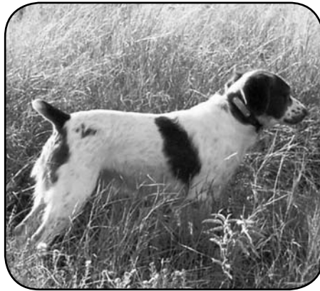
DC/AFC WAYSIDE'S BLUERIDGE RUNNER