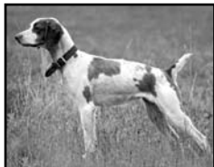
FC Sparky's Prairie Wind Gypsy