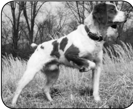
JAC'S OVER ACES