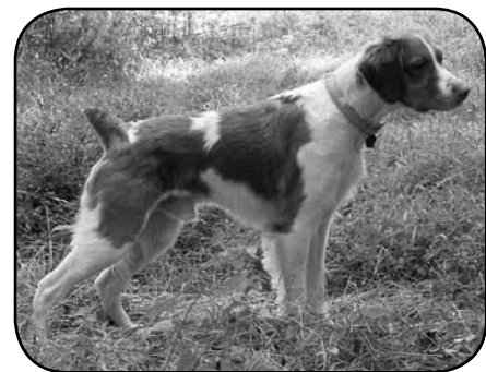
NAGDC/FC/AFC SPRING HILLS HOT WHEELS