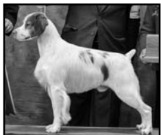
GCH Rainbow Splash's Ruggedly Handsome