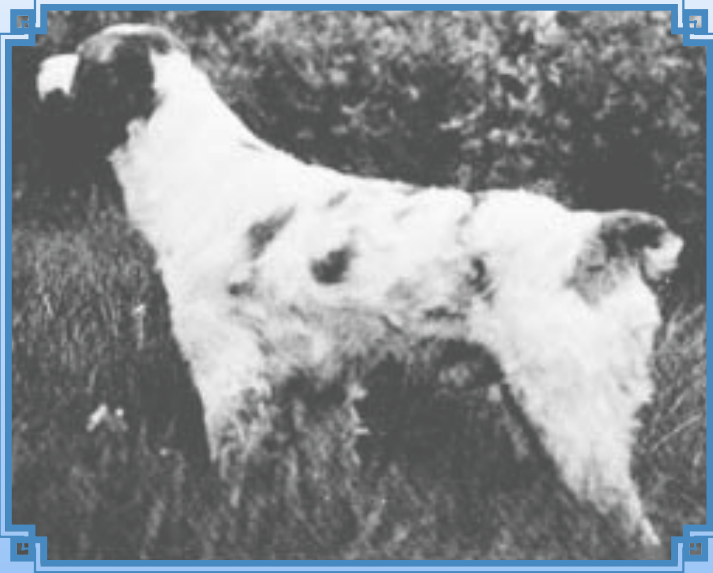
1965 DC Britt of Bellows Halls