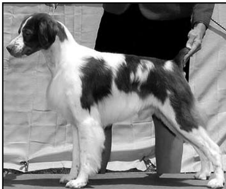
Best of Breed GCH TRIUMPHANT'S AS GOOD AS IT GETS JH