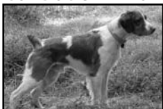
FC/AFC Spring Hill's Hot Wheels