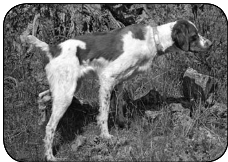
P AND J'S RIM ROCK