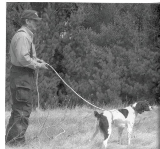
This dog has been stopped for the first time with the collar on the flank and the dog on a checkcord. The upright tail (or what there is of the tail!) shows the dog is still enthusiastic and accepting.

You'll want your dog quartering on a checkcord for the time being. The e-collar will be placed around the dog's flank or waist, with the contact points on the belly. If your dog is male, be sure the collar is placed ahead of his sheath. Adjust the collar so the points are snug against the skin, much like having it on the neck. Once the dog has moved a bit, check the collar and snug it up as needed, as it will often loosen up, much like the girth on a saddle will when a horse lets its air out.