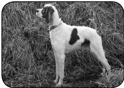
CIP'S TAILGATE RENDEVOUS