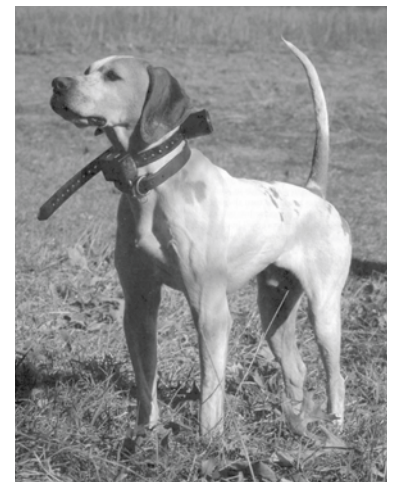
Close to the finished product: This fine young dog is clearly inhaling scent from the expression on his face, but he's staying steady to his training with the collar now on his neck.

How do we define chase? When the bird is in the air and the dog has committed to chasing it. Here's where the rule, "The level of distraction dictates the level of stimulation" comes into play: Anticipate the dog's