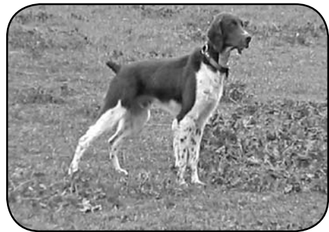
MVP REDLINE'S HIGH OCTANE