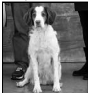
Jayhawker's Lucky Jack UDX4 OMG6