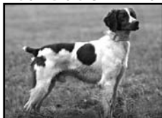
High Hopes Dark Nite