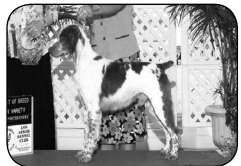
DIAMOND HILL DANGEROUS MAN