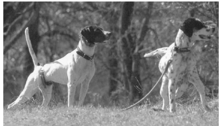
Here's a good example of working on backing drills, again with the collar on the flank.

Plus, with autumn and hunting season right around the corner, just imagine how much fun it will be to hunt over that classy, finished bird dog. The better trained your dog is, the more shots you'll get, and that makes for a great partnership in the field.