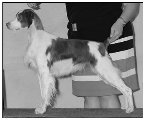
Winners Bitch / Best of Winners BLACK RIVER'S PRIVATE RESERVE

The following pictures were left out of the results for the Washington Specialty Show published in the August issue .