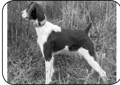
COPLEY'S DANGEROUS THREE OLIVE MARTINI