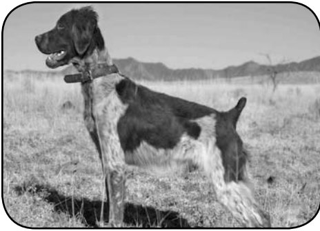
BLAZIN TACTICAL WEAPON