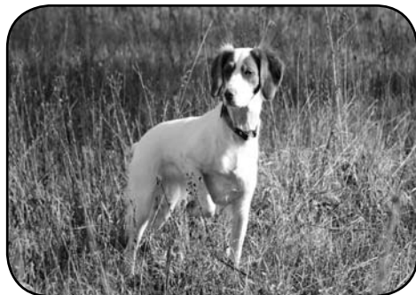
JJ's ALABASTER ANGEL