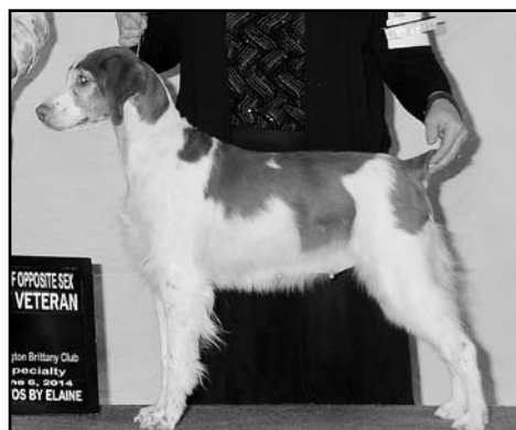
Best of Opposite Sex to Best in Veteran Sweepstakes CH DUNCAN PILOT POINTER