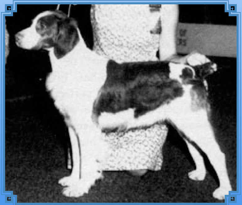
1983 DC/AFC/NAC Gringo De Britt