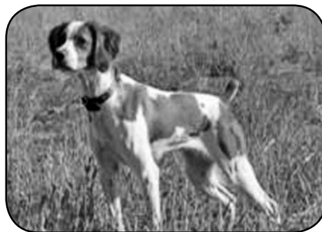
K NINE'S ON THE LOOSE