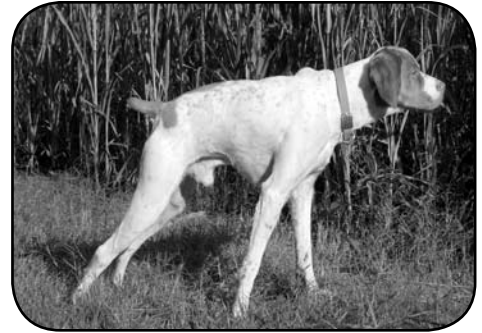
HOPES CAROLINA SUNSHINE