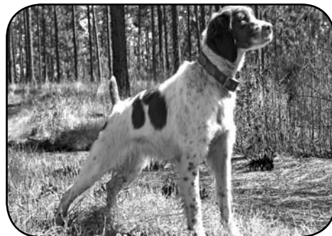
ROCKHARDS WALING ON THE MOON