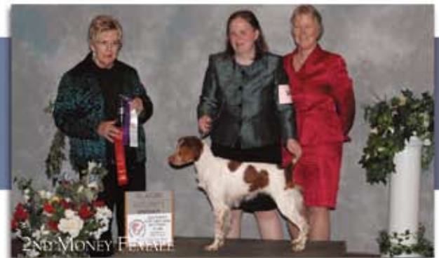
2ND MONEY FEMALE