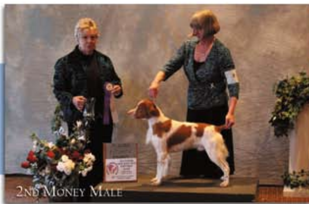
2ND MONEY MALE