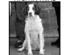
Jayhawker's Lucky Jack UDX4 OMG6