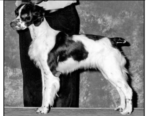
Best of Opposite Sex to Best in Veteran Sweepstakes CH VEM CALL ME SASSIE SUE MH