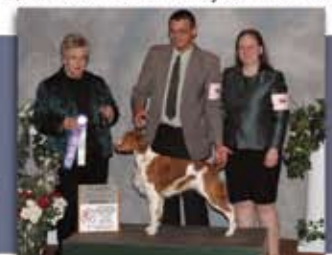
3RD MONEY FEMALE