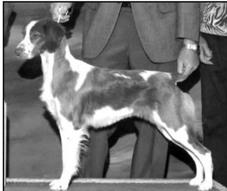
Best of Opposite Sex to Best in Sweepstakes FAROUT FIELD FOREVER FAITH