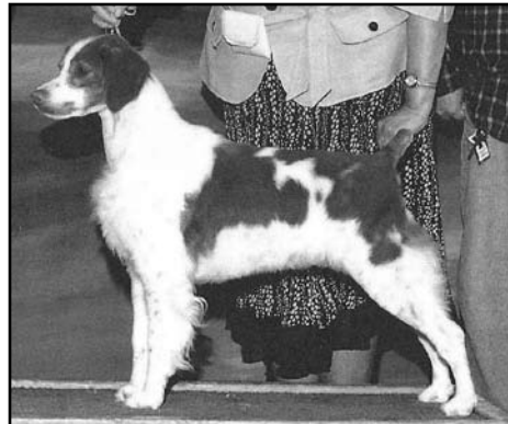
Best of Opposite Sex GCH WINCREST COPLEY CANDO ONE GRAND LOVE