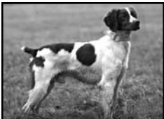
High Hopes Dark Nite