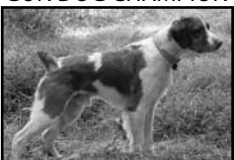
FC/AFC Spring Hill's Hot Wheels