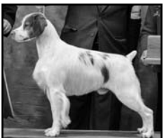
GCH Rainbow Splash's Ruggedly Handsome