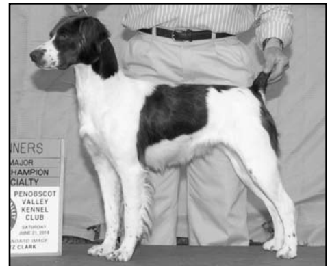
Winners Bitch BIRCH SPRING PC LUNAR ECLIPSE JH