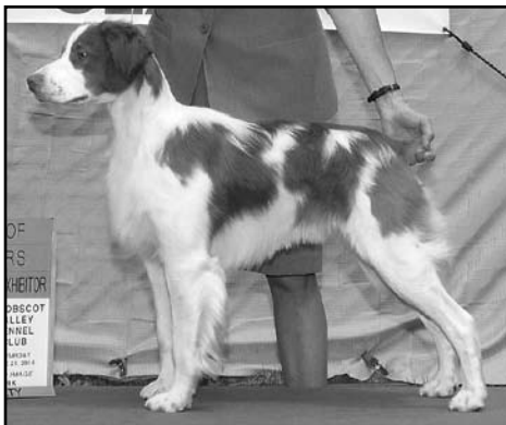
Best in Sweepstakes KINSHIPS TRIUMPHANT PURSUIT

Best of Opposite Sex to Best in Sweepstakes HORIZONS A WRINKLE IN TIME