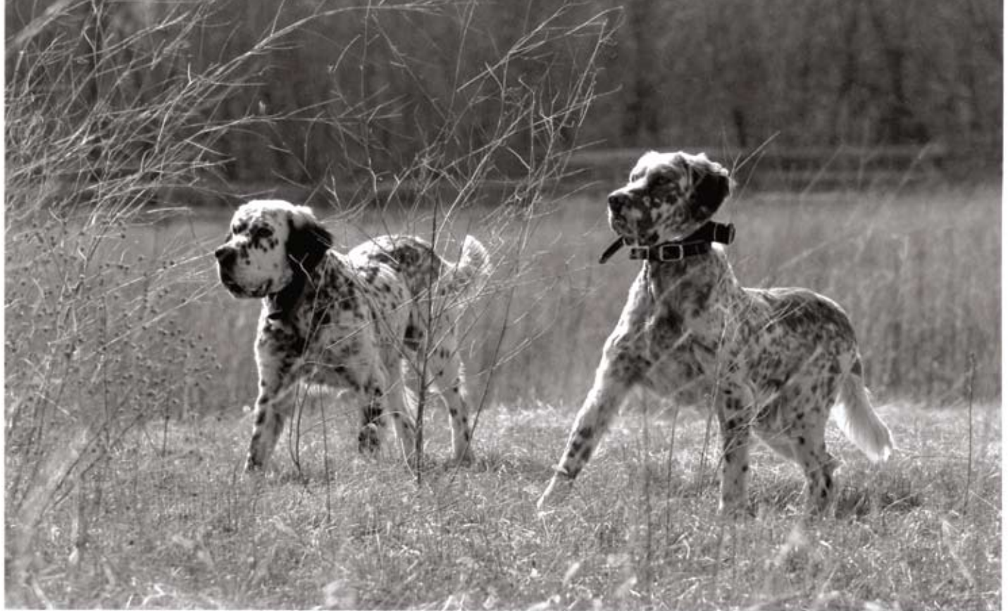
A backing/honoring exercise: The setter on the right is learning to honor and tried to steal point from the setter on the left. A correction was made by launching the bird when the dog got in too close, effectively telling the honoring dog that he screwed up. He's handling the correction well – a bit unsure, but alert and in learning mode.

doesn't put the dog in the right frame of mind to learn and makes our job a little tougher.