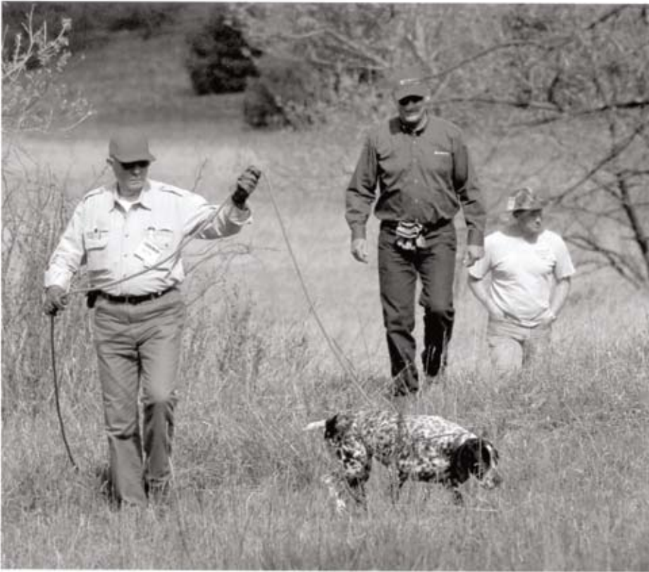
This young dog is learning about wearing the flank collar for whoa and is uncertain at the moment. No correction needed, just more repetitions and building confidence.

Training a dog is only as complicated as you choose to make it. If you try to rush things or do too many steps at once, it can be a snarled mess and take a lot longer because you're constantly having to fix things and re-do them.