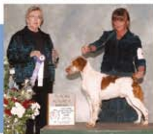
3RD MONEY MALE