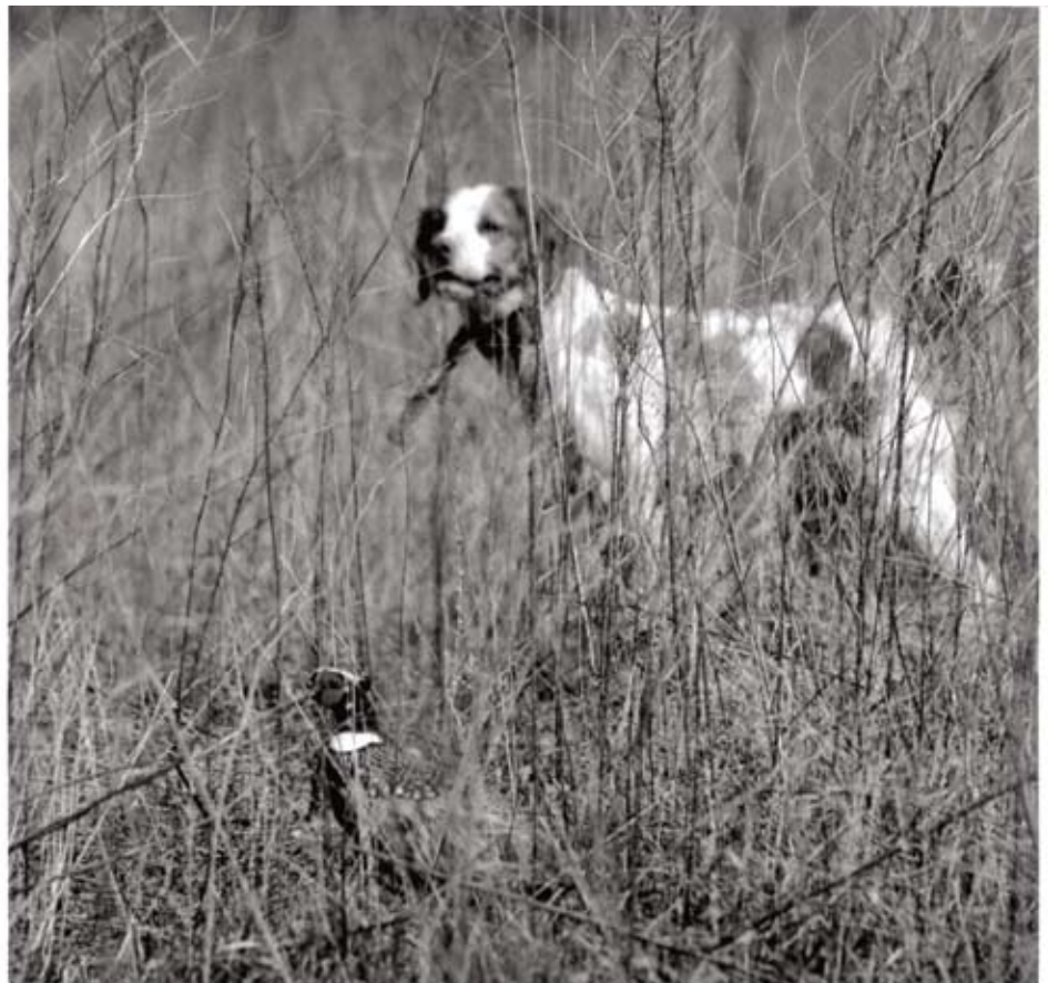
A Brittany pointing a pheasant on a warm spring day. This dog is confident even though it hasn't seen many pheasants before.

Let's go back to baking that cake or putting together that engine. Both are done in steps that need to be followed. If you just dump all the ingredients into a bowl and start mixing, you'll end up with a sloppy mess that doesn't much resemble a cake. It's simple chemistry: The ingredients need to interact according to the recipe for it to work right and produce a light, fluffy cake. And with that engine, if you don't put the rings on the pistons before installing them in the cylinders, your engine won't have the compression to run. Just like dog training, it's important to follow the steps and do each correctly and thoroughly if you want the best results.