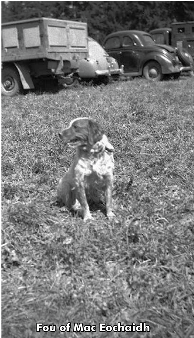
Fou of Mac Eochaidh