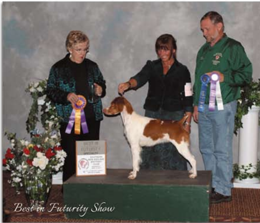
Best in Futurity Show