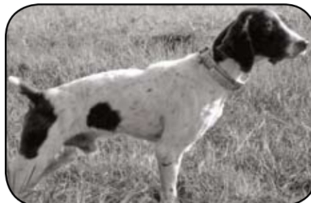
FC THE ACE OF SPADE