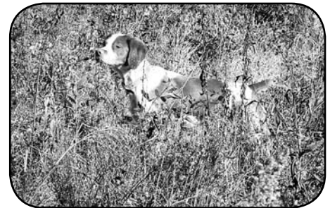
RJA CAPTAIN'S HEART-O-GOLD