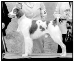
GCH Dream His Don't Hate The Player Hate The Game