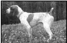
FC/AFC Suemac's Sky King NATIONAL SPECIALTY BEST OF BREED