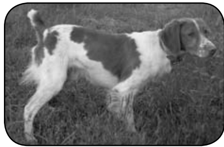
FC/AFC COVEYRISE FLYBOY