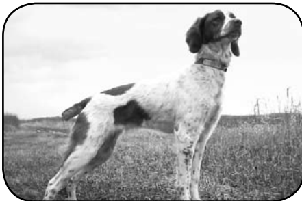
SPLASH'S FIRE GODDESS