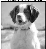
Jayhawkers Lucky Jack UDX5 OM8