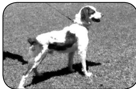
JAKE'S ROYAL LEGACY