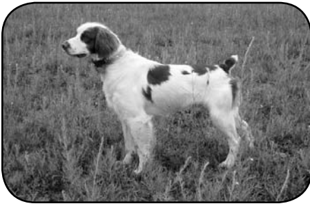
FC/AFC HAP'S SPICE RUM BECKHAM