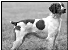
High Hopes Dark Nite NATIONAL AMATEUR GUN DOG CHAMPION