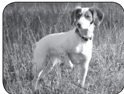
JJ's Levi The Lionheart