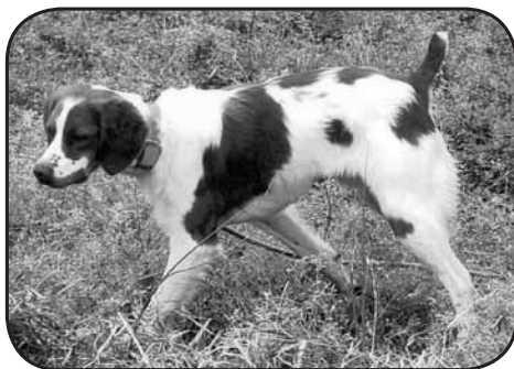
HI-TAIL'S STASH OF CASH