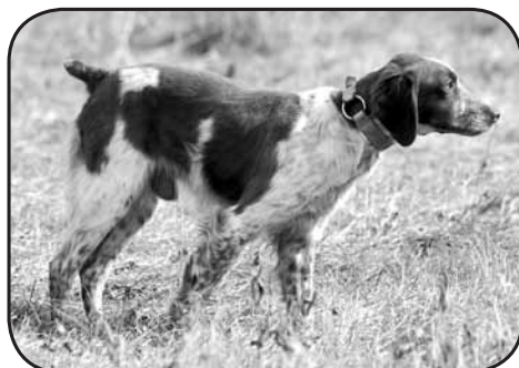
DR. BLOCK'S REACHER