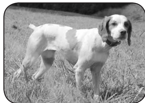
HIT'S A RED ROCK GIRL!