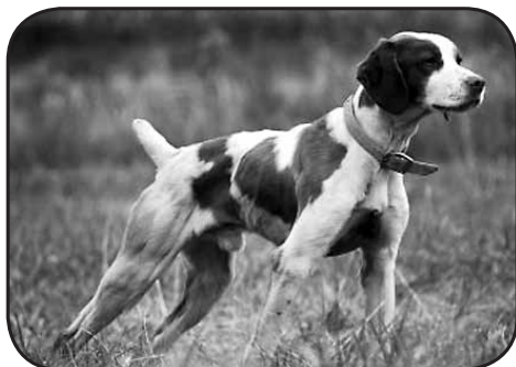
HITS ALL JACK'D UP