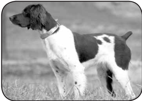
KIP'S BAY DARK N' STORMY MISS MADDIE