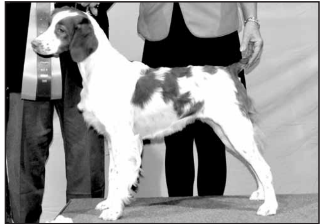
First Money Female TRIUMPHANT'S ABSOLUTELY STIRRED UP