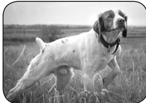
SNIKSOH SPANKS HANK