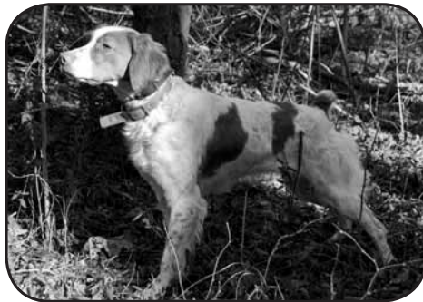
COVEYRISE MY GIRL SAL