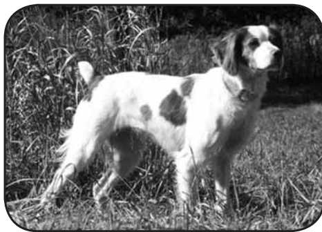
WOODLAND'S MONEY PIT