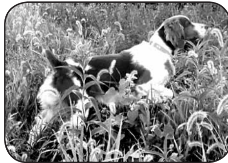
RICOCHET GUNSMOKES MR. DILLON