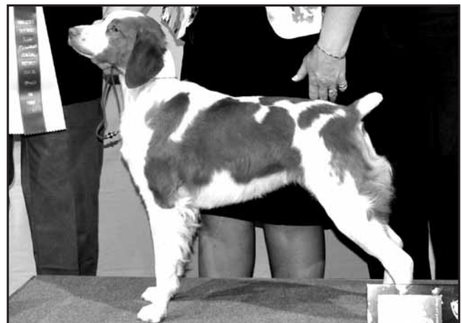
Third Money Female TURNING POINTS SHENANIGANS