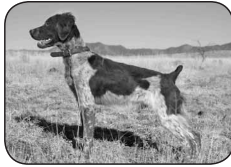
BLAZIN TACTICAL WEAPON