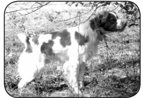
HOPES CHIEF OF CROSS CREEK