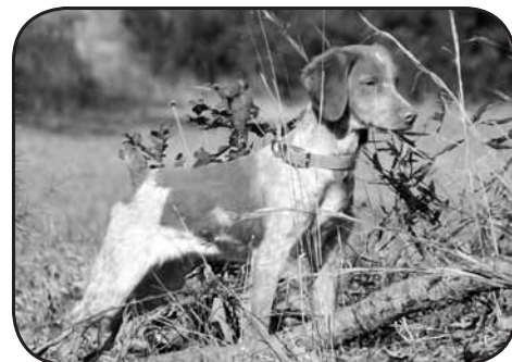
DIAMOND HILL WORK HARD PLAY HARDER