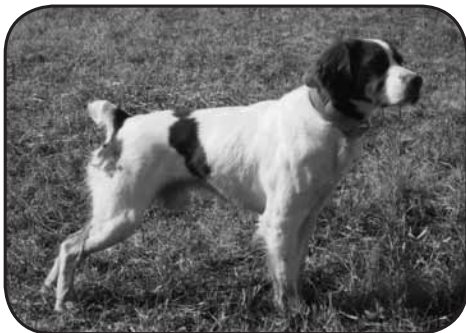
BURNING GLEN ENCORE