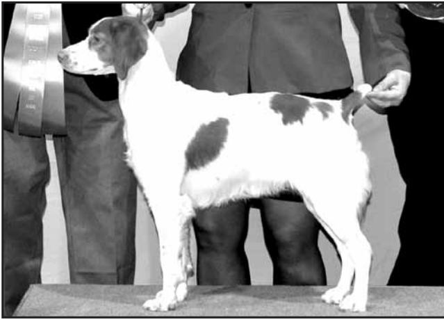
Dual Dog Winner OVER UNDER'S KICK IT OUT