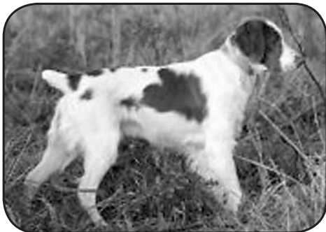
MCCHESENEY'S I GOT MY MOJO WORKING