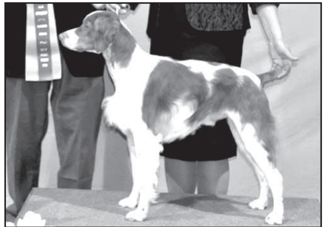
First Money Male AUTUMN GLOW THAT OLD BLACK MAGIC