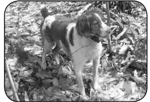
DOUBLE TRIGGER JOSEY