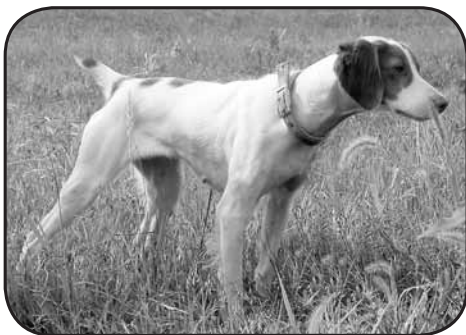
LET'S GIT-R-DONE NELLIE