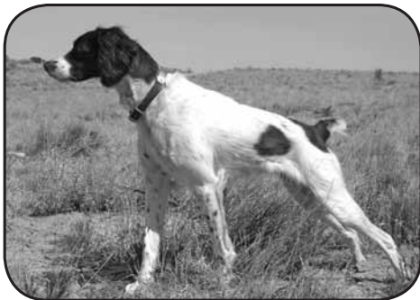
WINDY HILL SASSY KYLIE