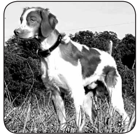
ANJ'S OHIO HELLION