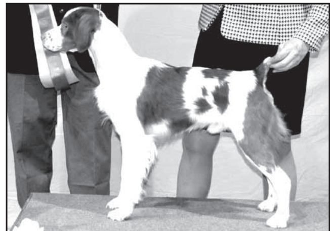
Second Money Male TRIUMPHANT'S RAISE YOUR GLASS