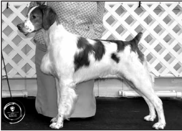
Third Money Male RIVERMIST BROXDEN SOVEREIGN MVP