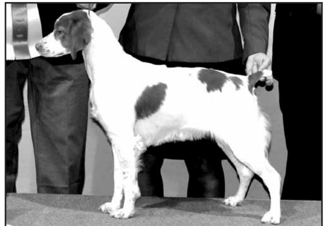
Second Money Female OVER UNDER'S KICK IT OUT