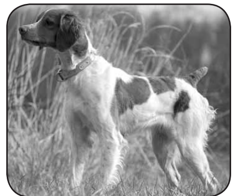
KIPS BAY ZAC'S A-TAC'N ELLIE

The field trial committee would like to thank all our participants, judges, bird planters, club members and spectators for their support. It is your generosity and participation that make these events possible. We could not put this trial on without you.