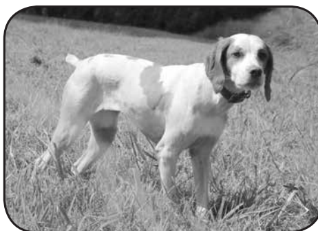
HIT'S A RED ROCK GIRL!