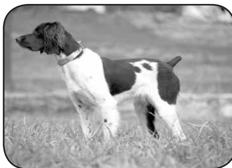
FC/AFC KIP'S BAY DARK N' STORMY MISS MADDIE