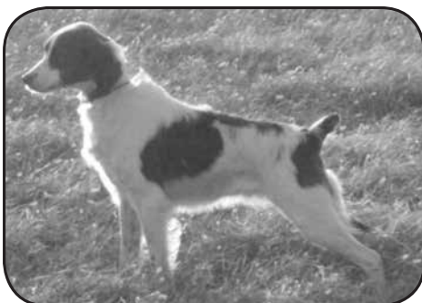
MISS ABBEY MEADOWS