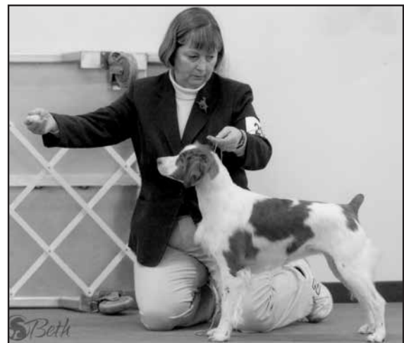
HILL'S BLAZIN ALPINE ROSE Winners Bitch / Best of Winners (AM & PM Show)

CH HILL'S CATCH THE SPIRIT CH SIPPEWISSETT'S STELLA CRUISE CH TONAN-RAO JUST BECAUSE IT'S CLEAR CUT CH OMEGA'S SWEET N SASSY MEG