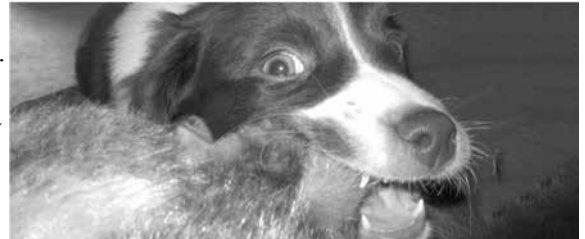
Puppy catching a stuffed duck.

Start with a hungry dog, using highly visible pieces of food. Light, large tortillas are one of my favorites since they drop slowly and are easily visible. Popcorn and lettuce are other options that fly slowly. Introduce catching in a safe, distraction free environment. If your puppy disengages and wanders away from you, use a leash on the dog (or a leash on the toy).