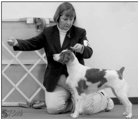
HILL'S BLAZIN ALPINE ROSE Best of Opposite Sex (AM Show) & Award of Merit (PM Show)

Owner—Handler Best of Breed HILL'S BLAZIN ALPINE ROSE