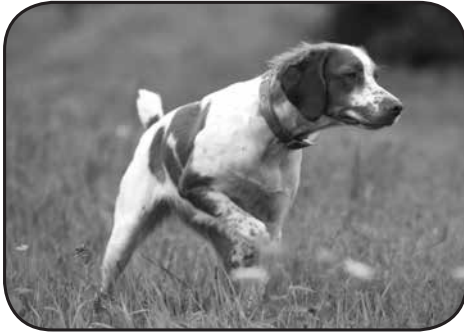
HY STEPPIN ANNIE OAKLEY