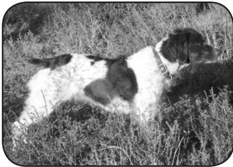
WINDY HILL TUMBLIN' TARA