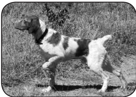
SPANISH CORRAL'S SONNY PATCH