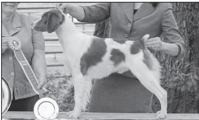
2nd Money Male CH TRIUMPHANT MAKER'S MARK