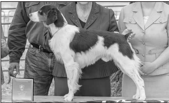
Dual Award Winner HORIZON'S CAUSIN' A COMMOTION JH