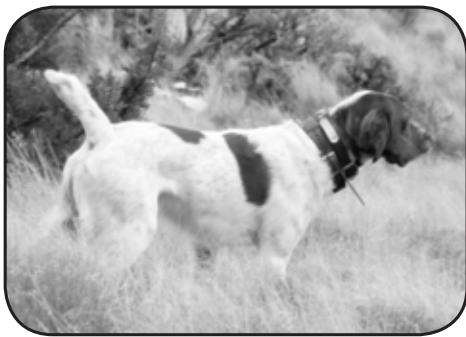
HIGH LONESOME SAGE