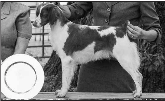
3rd Money Female TRIUMPHANTS TESTAROSSA