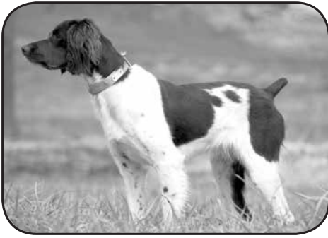
KIP'S BAY DARK N' STORMY MISS MADDIE