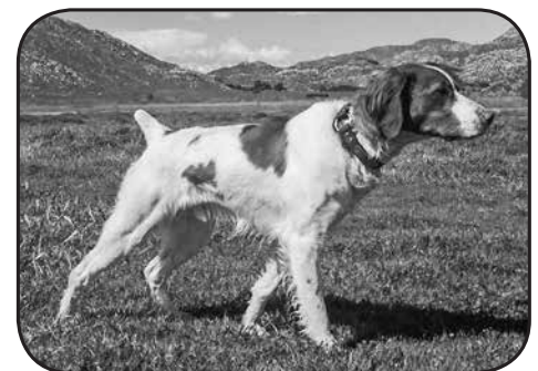
LEONA VALLEY'S SONNY RED SIDE UP