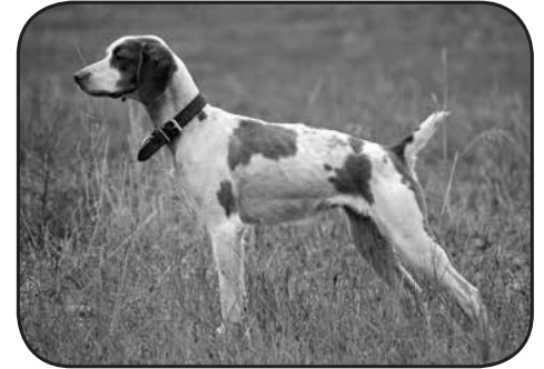
SPARKY'S PRAIRIE WIND GYPSY