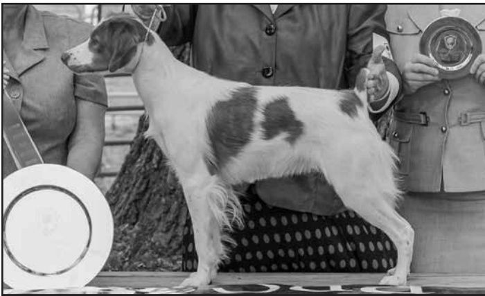
2nd Money Female GCH HORIZON-BREEZEWATER'S I'M THE ONLY ONE