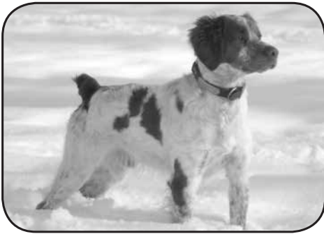
DIAMOND HILL DANGEROUS WEAPON