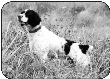
GROUSEWOOD REMADA OMBUDSMAN