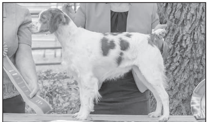
1st Money Female SIGBRIT'S READY TO RIOT