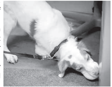
Boo sniffs audibly while searching under a desk.