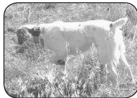
SPANISH CORRAL'S CHICA NEVADA