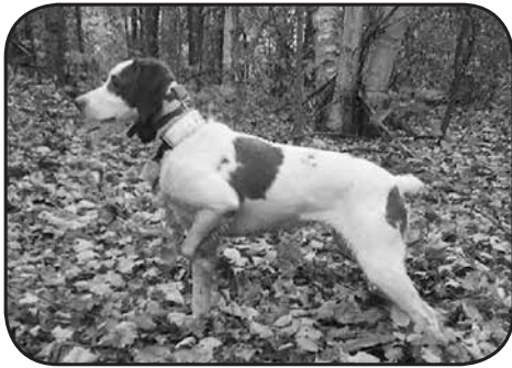
KDELS EAGLE'S CHANCE TO SOAR