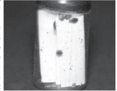
Sealed vial of bed bugs, shed skins and feces, used for training bed bug detection dogs.

Professional sniffer dogs must learn to ignore dead bugs and detect only live bugs and eggs. That distinction is important since dead bugs don’t require extermination, while live bugs require expensive treatment. So, if you want to be a bed bug canine handler, you need to keep live bed bugs, and face the associated risks. Never