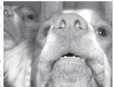
Two bed bug detection dogs eagerly waiting to go to work.