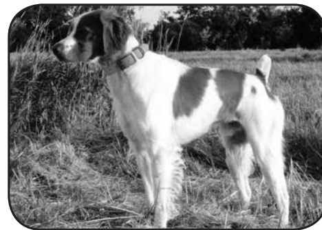
TOUCH OF BOURBON LITTLE CHUG