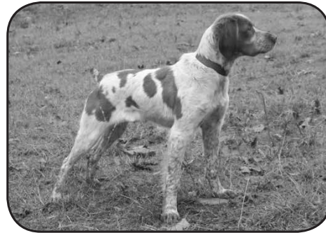
DIAMOND HILL STORM CAT