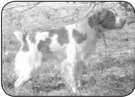
HOPE'S CHIEF OF CROSSCREEK