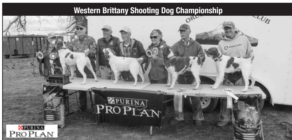
Western Brittany Shooting Dog Championship