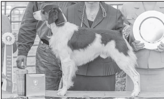
1st Money Male HORIZON'S CAUSIN 'A COMMOTION JH