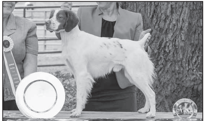
3rd Money Male SIGBRIT'S LUCKY JH