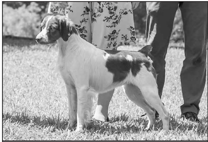
Winners Bitch QUAIL TRAIL'S WATCH YOURSELF