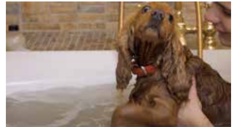
Figure 3. This dog's head is turned away, with wide eyes, a stiff mouth and panicked feet show they are not comfortable with being restrained in a full bathtub of water.

Carla Simon is a scent detection trainer, Canine Good Neighbour evaluator and breeder from Calgary, Canada. Her Hunter's Heart Brittanys have achieved Top 5 rankings in obedience, agility and conformation.