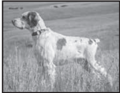
FC/AFC Wild Wild Willie