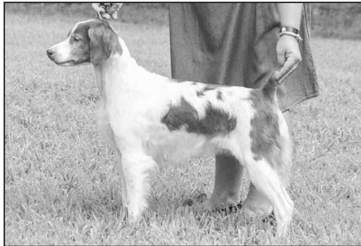
Best in Veteran Sweepstakes/Best of Opposite Sex GCH ILLUSION N' LABYRINTH KISS THIS SH TKI CGC

Best of Opposite Sex to Best in Veteran Sweepstakes CH SHADY BROOKS SPECIAL "ADDITION" SAMMIE CGC TKN BCAT