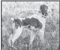
NGDC/GCH/DC Turning Points Shenanigans