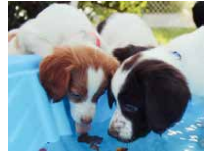
Figure 1. Young Brittany puppies investigating leaves in a kiddie pool.

Each pitfall is explained below, in hopes you can avoid them, when raising your next Brittany puppy.