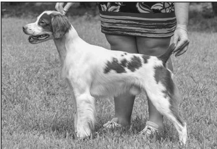
Best of Winners/Winners Dog SUNSET'S DIAMONDS IN THE SKY