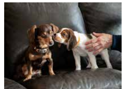
Figure 2. A Brittany puppy meeting a Dachshund he doesn't live with.

According to the AVSAB position Statement on Puppy Socialization, puppies should be exposed to "as many new people, animals, stimuli and environments as can be achieved safely and without causing over-stimulation manifested as excessive fear, withdrawal or avoidance behavior". Up until 3 months of age, sociability outweighs fear. Therefore, it's the best window of time to adapt to new people,