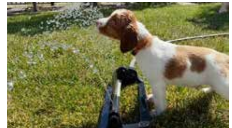
Figure 4. While off-leash, this puppy chooses to investigate a sprinkler.