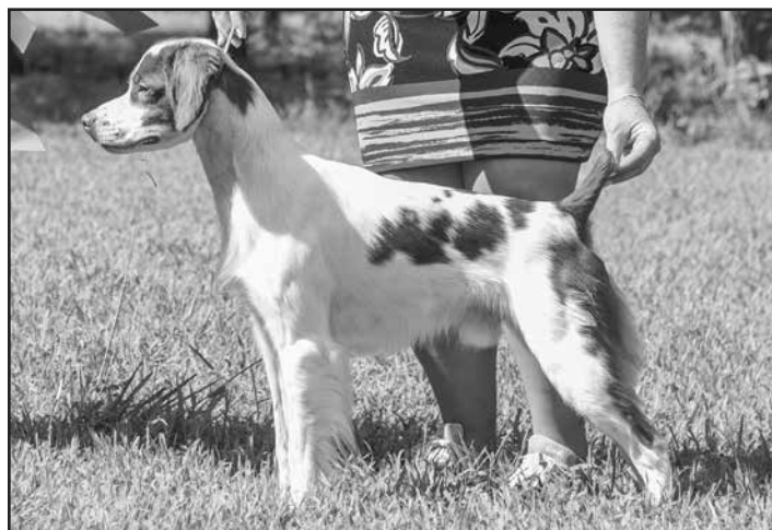
Best of Winners/Winners Dog SUNSET'S DIAMOND IN THE SKY