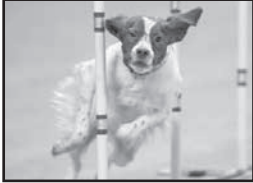
GCH CH MACH2 Rustin's Future So Bright