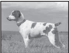
NAFC/GFC/GAFC Ru-Jem's "Last" Penny