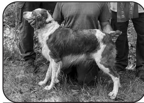
DRUMMER'S NIGHTMARE NED