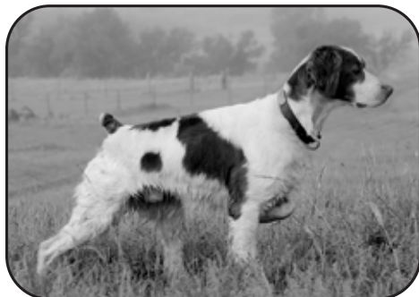
SOVEREIGN'S CHASING LEGENDS