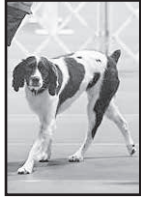
Wild Mtn Runaway CDX