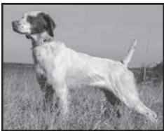
GFC AFC CVKs Spartan King