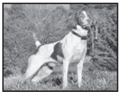
Piney Run Hilltop Blew