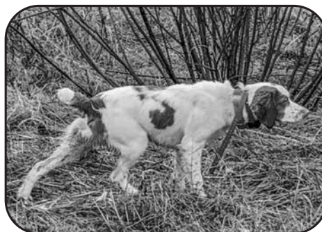
DR JAC'S BANTAM AUTUMN O'DEE