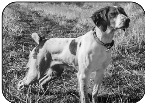
LEONA VALLEY'S MICRO MOOSE