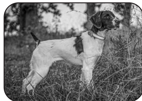
SOVEREIGN'S HANKY PANKY