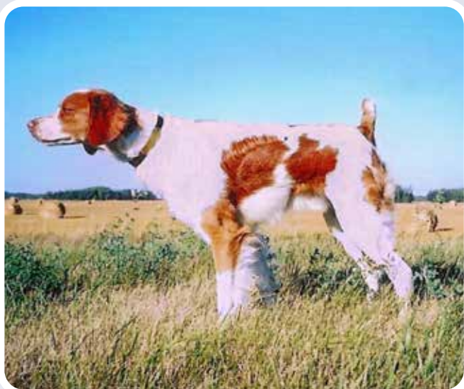
2020 Hall of Fame Inductee DC/AFC Grand Junction Jake

December 2022 • Volume LXXIV • Number 12