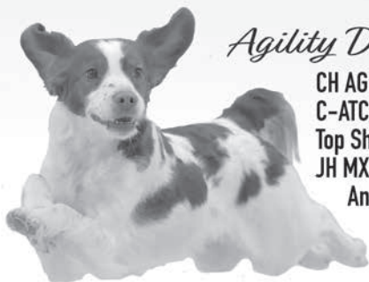
Agility Dog of the Year