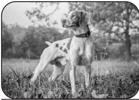
CROSS CREEK SOVEREIGN POP-A-TOP