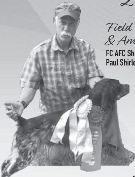
Field Dog of the Year & Amateur Field Handler Award