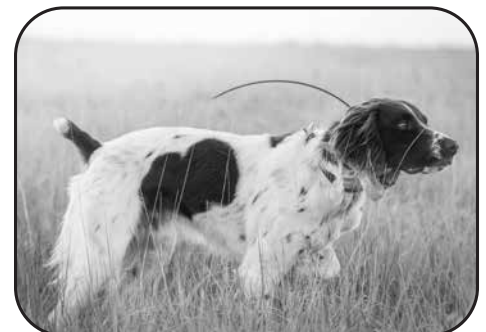
SNIKSOH HANK'S HATCH