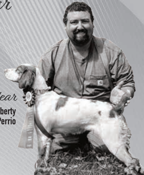
Juvenile Field Dog of the Year