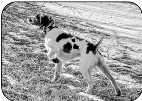
CEDAR GLEN DISRUPTIN' THE PEACE