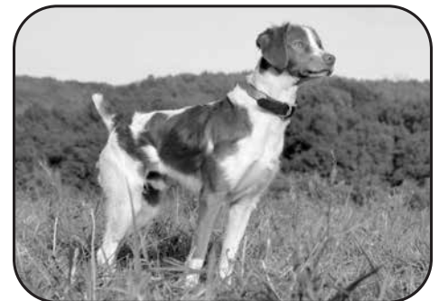
ANJ'S OHIO HELLION