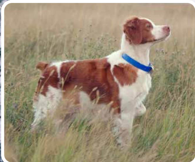
2020 Hall of Fame Inductee DC/AFC/NBOB Tequila With A Twist