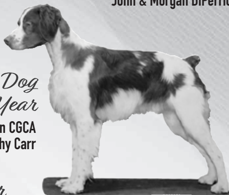
Show Dog of the Year