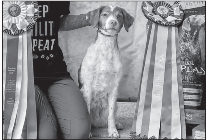
National Specialty Agility High In Trial STAR FLIGHT MADHOUSE ON MADISON