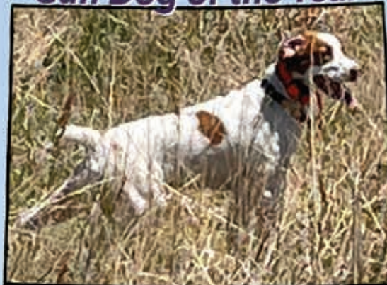
Windtuck's Jumping Cholla SH AXP AJP