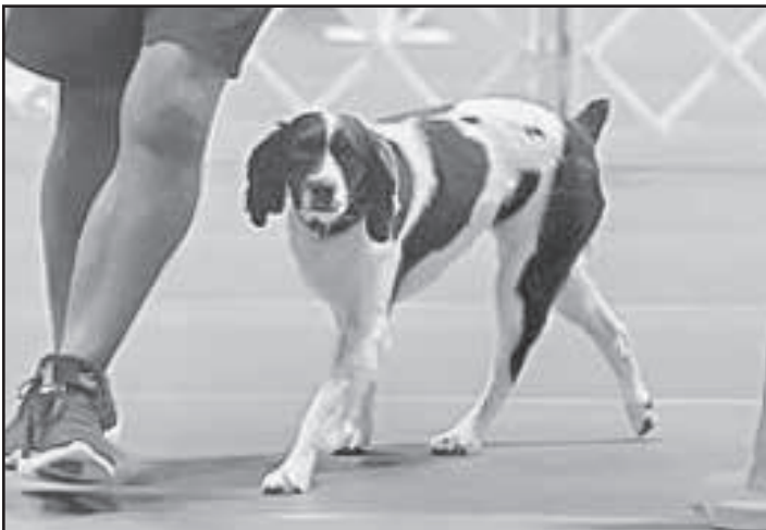
National Obedience High in Trial WILD MTN RUNAWAY CDX

*Disclaimer: Full results and photos for the 2021 National Specialty Show were not received at time of printing. Therefore, published here is a partial listing of results and photos.