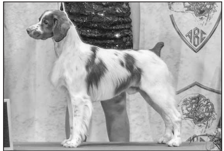
Best of Breed GCHG/CH TAIL'Z END TURBO POWER FROM DUAL LANE'S JH CGC TKN

Best of Winners KETTLE HILL'S COULD I BE ANY MORE HANDSOME