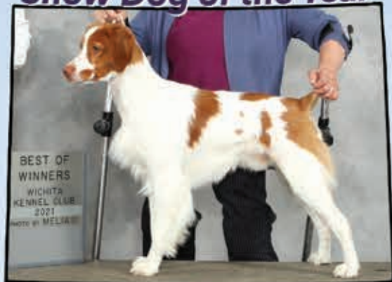
CH Cimmaron's Traveling Man Jameson