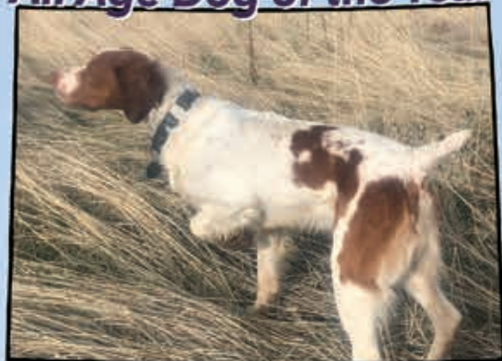
FC Sniksoh Worthy Expense