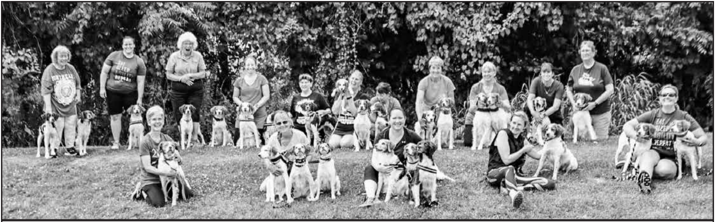
All Brittany participants with Owners