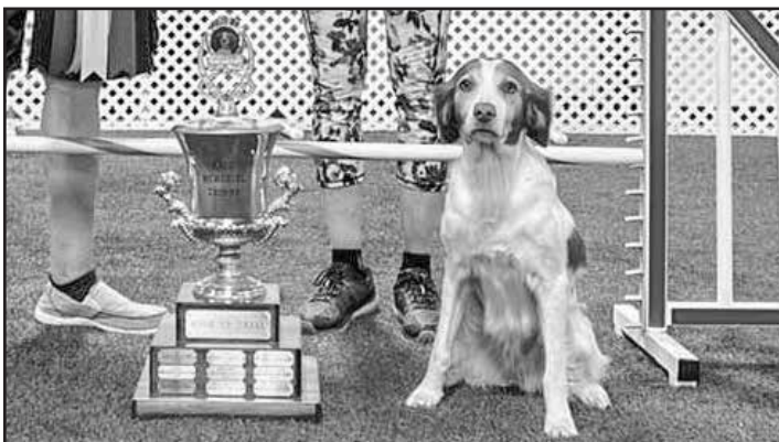
Kaze Memorial Trophy for High in Trial - Kir

*Disclaimer: The writeup for the 2022 Summer Specialty Show were not received at time of printing. Therefore, published here is a partial listing of results and photos.