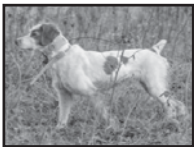
CH Tequila Chica Bonita