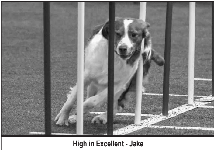
High in Excellent - Jake