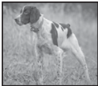
GCH/CH NMR Labyrinth Late Nite Summer Skye SH