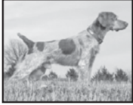
NAGDC/FC/AFB B&T's Sonndance Kid Rock