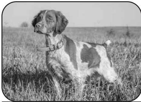
STELLAR FIFTY ONE