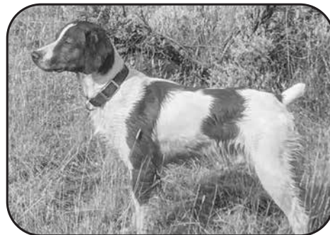
CHRISTIE'S I'M A JAKESTER