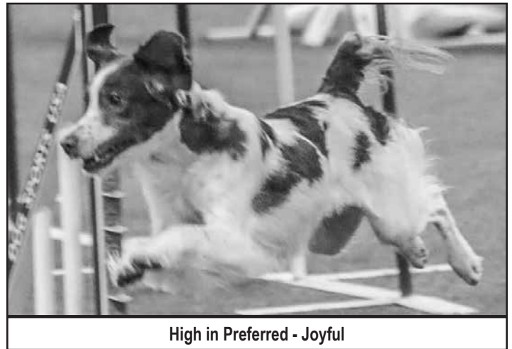
High in Preferred - Joyful