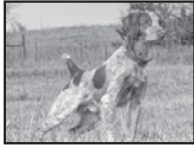
FC B&T's Sonndance Kid Rock