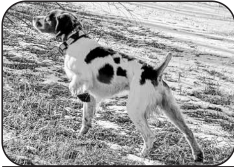
CEDAR GLEN DISRUPTIN' THE PEACE