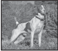
NAFB/FC/AFB Piney Run Hilltop Blew