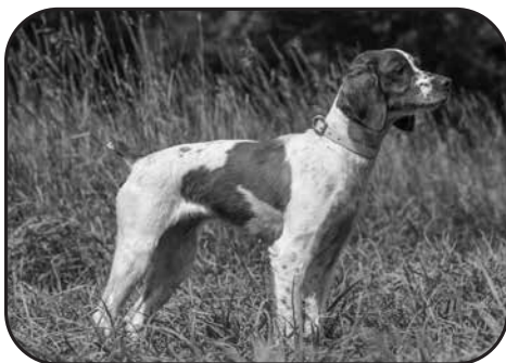
BURNING GLEN COVER GIRL