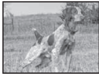
FC B&T's Sonndance Kid Rock