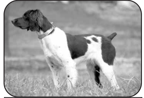
KIP'S BAY DARK N' STORMY MISS MADDIE