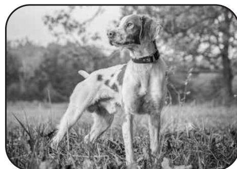
CROSS CREEK SOVEREIGN POP-A-TOP