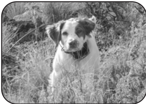
HIGH LONESOME BOWDEN HILLS