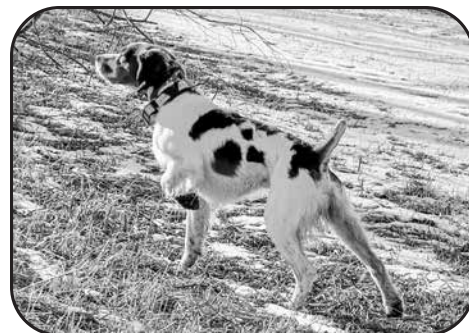
CEDAR GLEN DISRUPTIN' THE PEACE