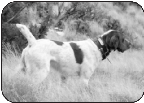
HIGH LONESOME SAGE