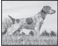
NAGDC/FC/AFC B&T's Sonndance Kid Rock