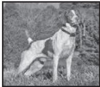
NAFC/FC/AFC Piney Run Hilltop Blew