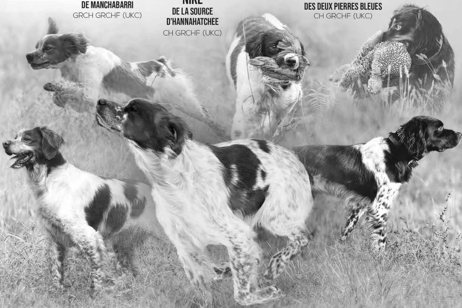
JET DI VAL GROSSA CH España, CH Gibraltar, Spanish monograph (National) winner, France monographic RCAC, CH Mundo, CH European, CH Internacional