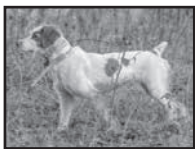
CH Tequila Chica Bonita