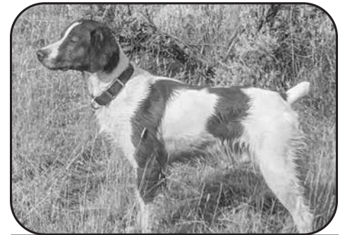
CHRISTIE'S I'M A JAKESTER