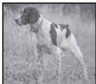
GCH/CH NMR Labyrinth Late Nite Summer Skye SH