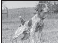
FC B&T's Sonndance Kid Rock