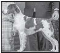
GCH Hopes Copper Pennie