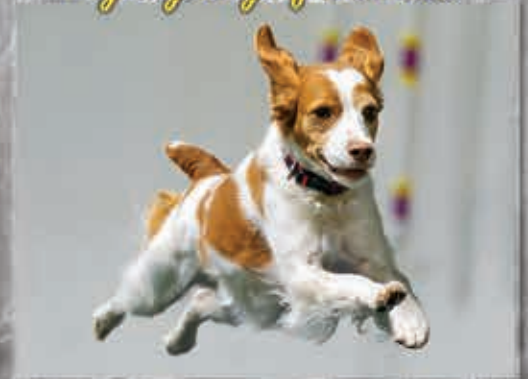
MACH6 Just Another Brit in the Wall RAE MXG2 PAD MJB3 MXF T2B2 SBN