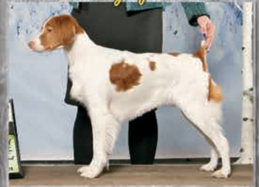
GCHB CH Keili's Hope Something to Talk About RI CAA DCAT CGC