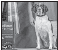
Wild Mtn Runaway UD