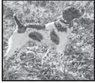
DC/GFC/AFC Starlight's Mercury Out Ryder