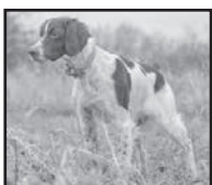
GCH/CH NMR Labyrinth Late Nite Summer Skye SH