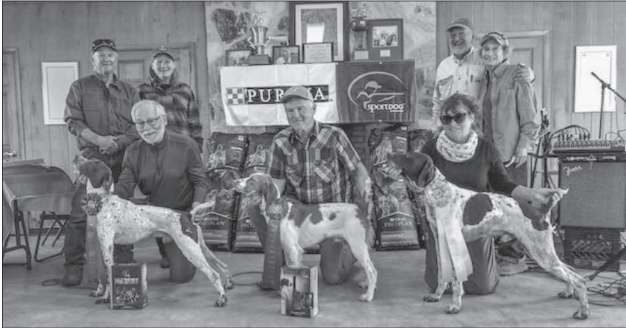
The following writeup and photo were inadvertently left out of the Tarheel field trial that was published in the April magazine.

With sunshine and temperatures in the low to mid-50's, 19 dogs came to the line to compete for the title of "Regional Champion" in the maiden running of the Tarheel Grand Open Limited Gundog Continental Breed Regional Championship between 13 and 15 February 2023. Hosted by the Tarheel Brittany Club at the Dick Cross WMA in Boydton, VA, the event represented the first AKC newly sanctioned Continental Breed Championship in the South Carolina-North Carolina-Virginia Region.