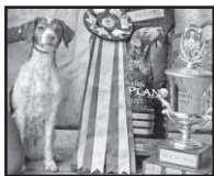
GCHB/CH/MACH3 Star Flight Madhouse on Madison SH