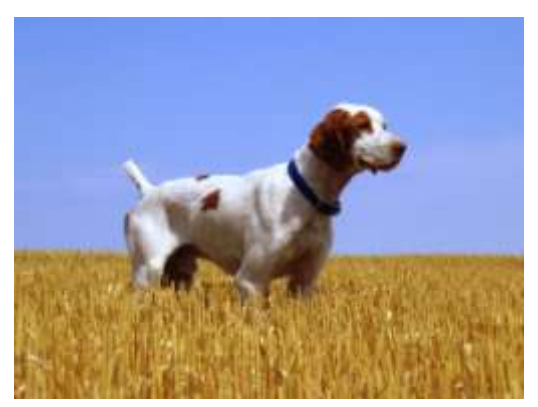
2x American Field Champion & 3x American Field Runner-Up FC Ortho Acres Booker T May 1999 – August 2009