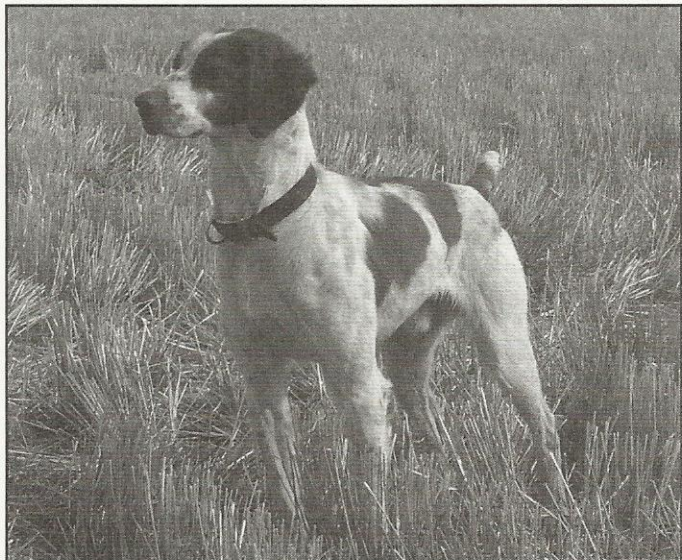
2004 Winner SMARTEYE'S JOKER.